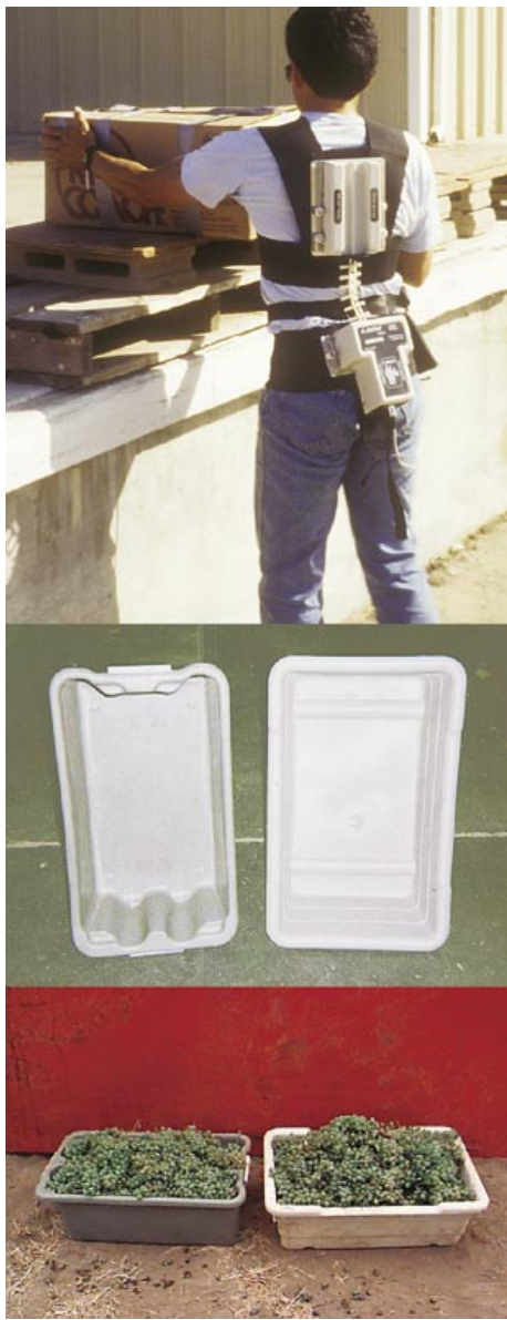
Top , the authors fitted workers with an exoskeleton called a Lumbar Motion Monitor to study their movements during a simulated hand-harvest of grapes. Middle , the intervention tub (left) and standard tub (right). Note the smooth bottom and added handles on the intervention tub. Bottom , the intervention tub holds an average of 11 pounds less grapes than the standard tub.