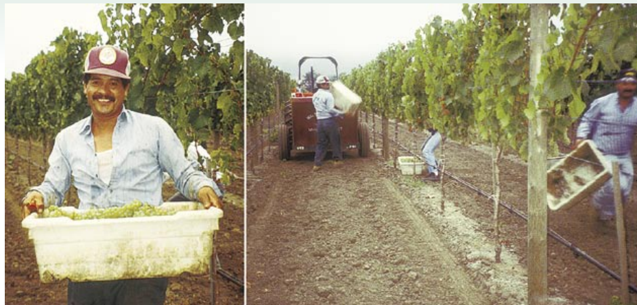
In wine grape vineyards, harvest workers suffer from a high rate of musculoskeletal disorders. Switching to a smaller picking tub can reduce the level of reported symptoms without significantly affecting productivity.

Total costs for a first-time back injury can reach $10,000, with costs for repeated back injuries reaching as much as $300,000 (OSU Research News 2001; NRC-IOM 2001). With an average of 3,350 back injuries reported each year