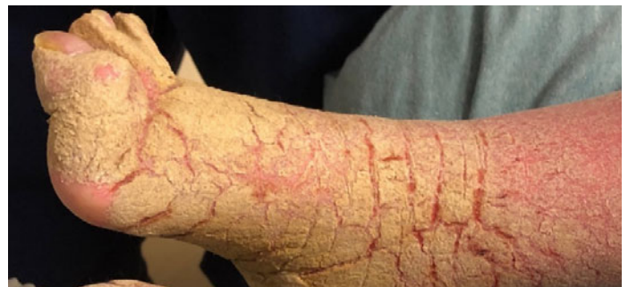
Figure 1. Clinical photo of the right dorsal foot showing thicker, more confluent scale.

Contact precautions were initiated, an institutional infection control consultation was obtained, and the