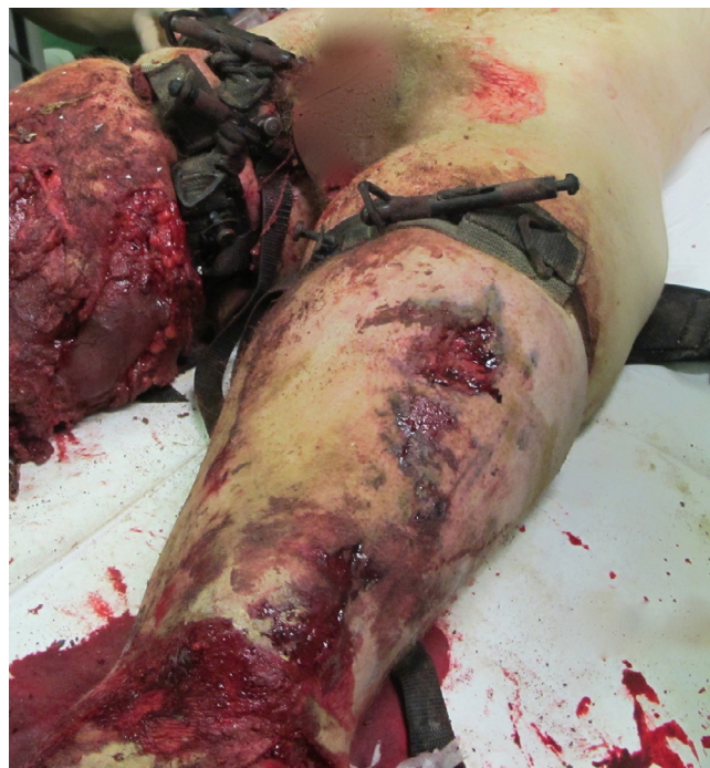
Fig. 2. 22-year-old Marine with bilateral tourniquets in place for severe lower extremity trauma due to detonation of an improvised explosive device.

Penetrating trauma was the cause of injury in most cases (Table 2). The majority of penetrating trauma was caused by explosive ordnance (56%), followed by gunshot wounds (36%). Vascular injuries were most seen followed by open fractures (Table 3). Two patients had traumatic amputations at presentation.