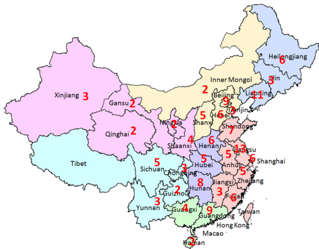
Figure 1 Distribution of hospitals for the Improving Care for Cardiovascular Disease in China-atrial fibrillation programme. Numerals on the map indicate the number of hospitals in the area. From Hao et al. 18

improvement (from 45% to 51%) in primary composite score means that >6% guideline recommended treatments will be correctly given for patients with AF. Researchers from SMG, project management group and participating hospitals have the access to analyse the data in a de-identified way, in both hospital level and patient level. Categorical variables are presented as frequencies and percentages and continuous variables are as means and SD or medians and IQRs. Missing data are managed based on the purpose of the study and analysis method used. The \chi^2 trend test is performed to evaluate the temporal trend of performance measures. Univariate and multivariable analysis are performed to recognise the element related with outcomes concerned, for example, the implement of specific treatments and in-hospital events. To address intrahospital correlation, generalised estimating equation models will be applied. All statistical analyses are performed by SAS V.9.2 (SAS Institute). Two-sided p values <0.05 are considered statistically significant.