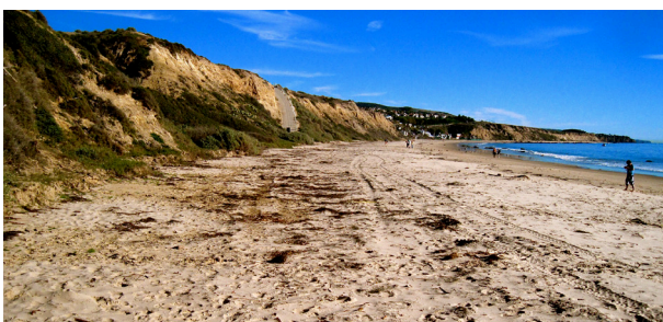
Crystal Cove State Park in Orange County, a natural beach with intertidal wrack brought ashore by waves and tides. Nicholas Schooler