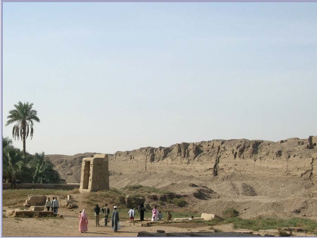
Figure 4. North temenos wall at Dendera showing concave and convex sections.

and mud-brick foundation walls dating to the reign of Senusret I at Tod, as well as the single spectacular example of the Satet Temple of Elephantine, the excavation of which revealed multiple iterations of mud-brick construction before an increasing number of stone architectural elements were added, starting in the 11 th Dynasty and continuing through to the 18 th Dynasty (Dreyer 1986: 11 - 36). Frequently, excavations have uncovered the temple enclosure walls contemporary with both early brick and stone temples, even when there remains little to no evidence of the original temple structure itself, as at Abydos and Medamud (Spencer 1979a: 62 - 63). Massive temple temenos walls became increasingly common through time, with many kings of the Late Period reconstructing enclosure walls, particularly with the expansion of temple precincts, as at Karnak and Elkab (Spencer 1979a: 64 - 82). These temenos walls were constructed in sections with either alternating convex and concave