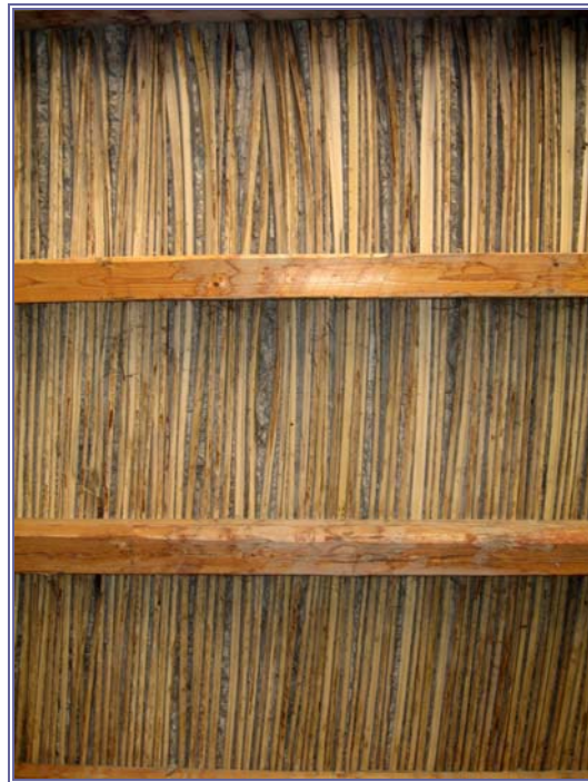
Figure 2. Underside of traditional flat roof at Hassan Fathy residence, Thebes.

3. Roof construction. Upon the completion of the walls, mud-brick buildings were roofed in one of two fashions: with flat roofs or with vaulted roofs. Flat roofs were created by laying wood cross-beams perpendicular to the face of the wall spanning the space from wall to wall or from wall to architrave (supported by columns), laying palm ribs, reeds or reed matting from beam to beam, then covering this layer with mud plaster (fig. 2; Arnold 2003: 47; Jéquier 1924: 289; van Beek and van Beek 2008: 287 - 310; Henein 1988: 42 - 43); this style of ceiling construction is essentially identical in execution to viga and latilla construction of the American Southwest. In the most important rooms at the palace of Malqata, the underside of the ceiling was plastered, filling in the spaces between the crossbeams, in order to create a smooth, level surface for painting (Tytus 1994: 13). Vaults