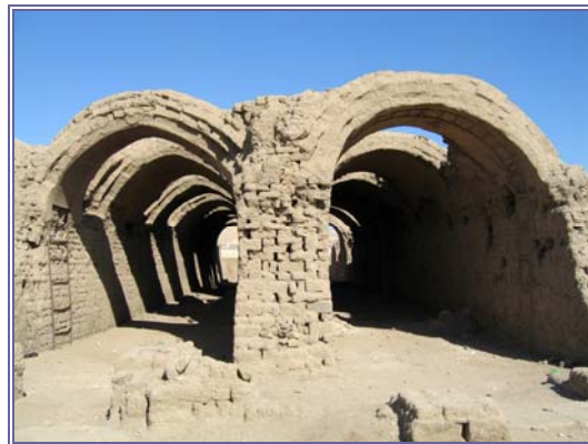
Figure 3. Vaulted storage magazines at the Ramesseum.

could be laid using the same bricks as were employed in the construction of walls or could be created with bricks made specifically for the job (fig. 3). In the latter case, the bricks are thinner and lighter and could even be wedge-shaped, rather than rectangular, to facilitate the shaping of the vault; specialized vaulting bricks often were scored with finger-marks when they were produced, a feature that increased the bonding of mortar to the