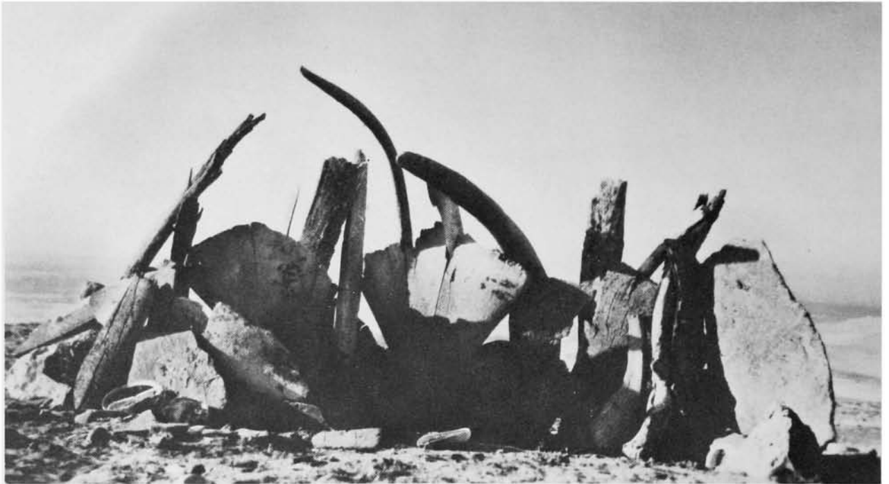
Fig. 5. Overall view of reconstructed hut. Photograph by Marion Hollenbach, December 1, 1940.