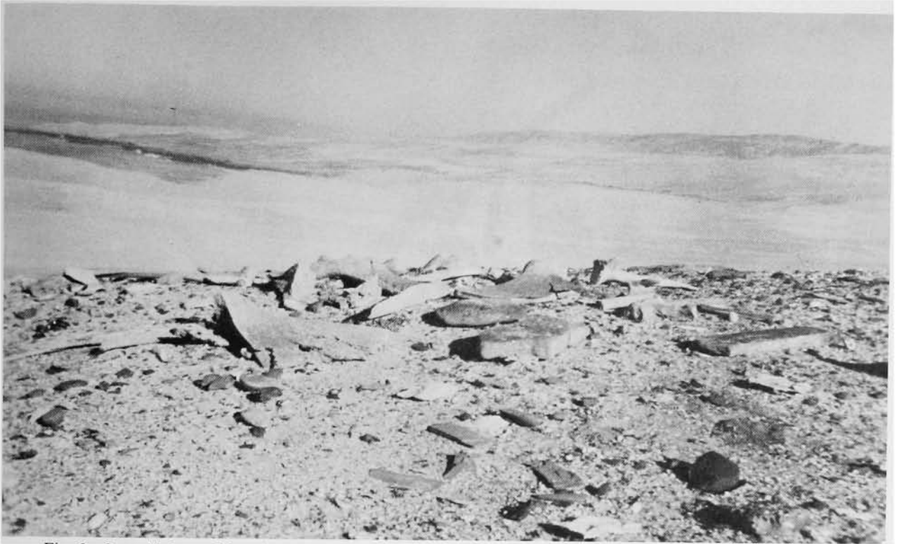
Fig. 3. Overall view of hut site before re-erection. December 1, 1940.