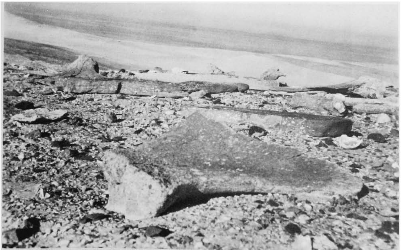
Fig. 4. Close-up of large bones and flat rocks in hut site. Photograph by Marion Hollenbach, December 1, 1940.