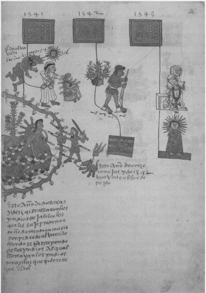
Figure 1 Codex Tellerino-Remensis, fol. 46r