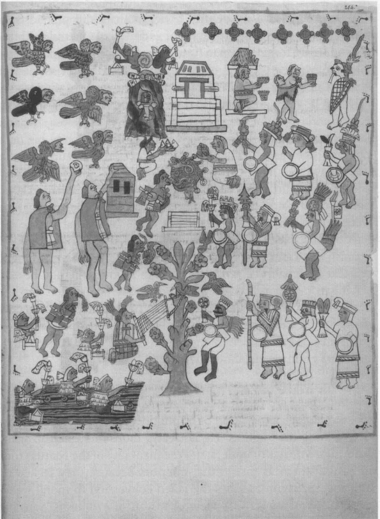
Figure 6 Bernardino de Sahagún, Primeros memoriales . Codice Matritense del Palacio Real de Madrid, fol. 254r