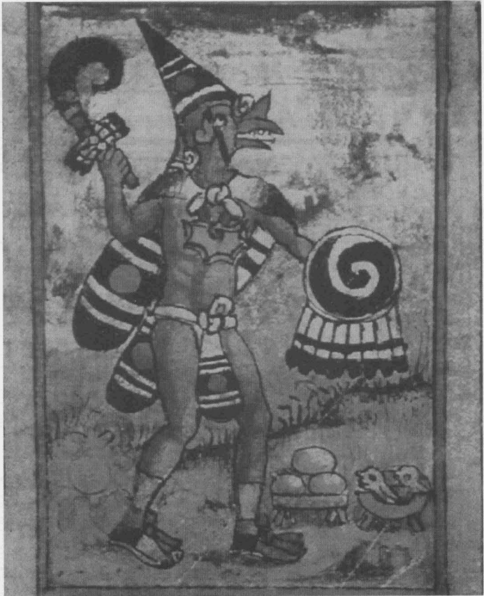
Figure 5 Diego de Durán. Historia de las Indias de Nueva España e Islas de Tierra Firme. vol.2, plate 13