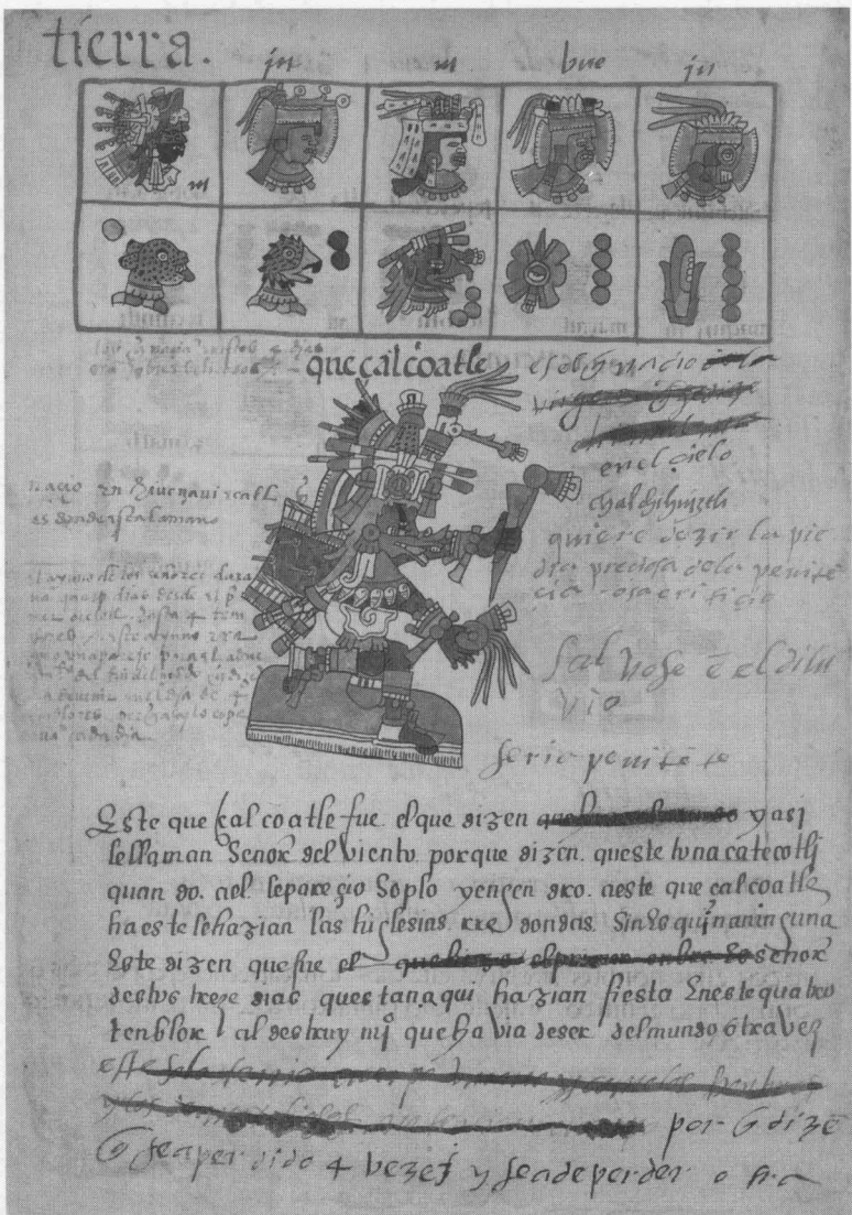
Figure 4 Codex Tellerino-Remensis, fol. 8r