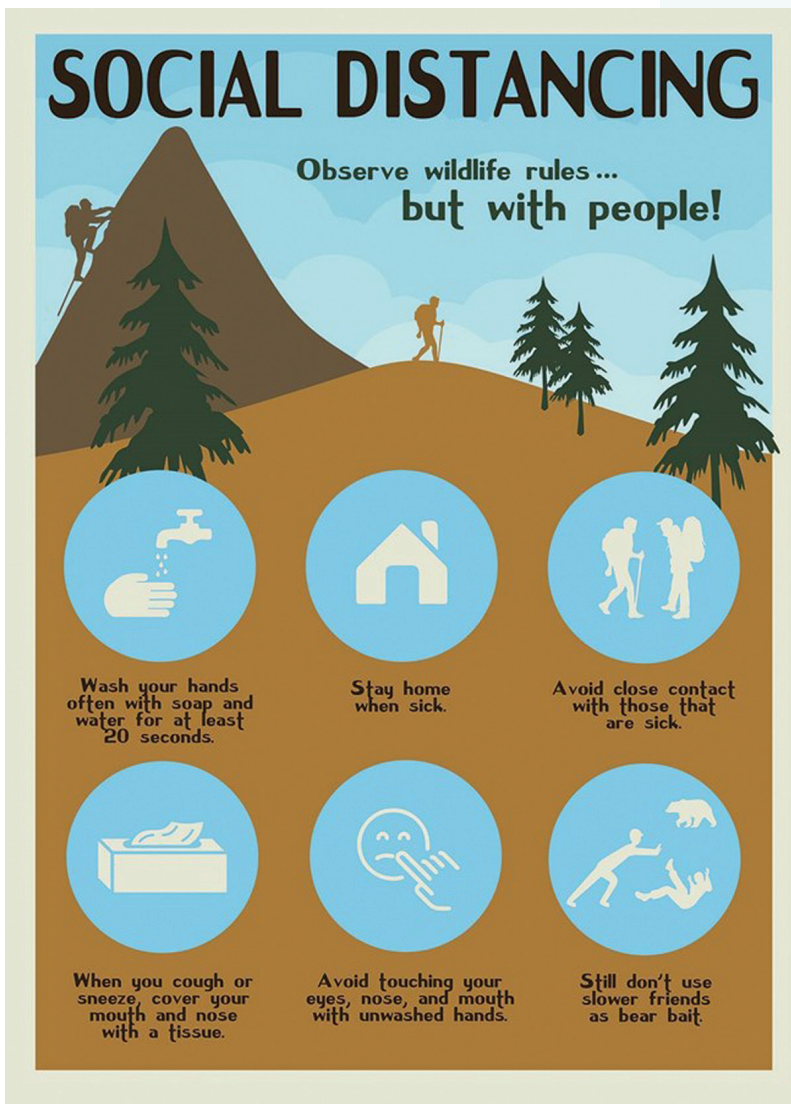
Covid-19 safety poster, website of Saint-Gaudens National Historical Park.

elements of a mitigation strategy for widespread environmental disruption. These plans all hinge on a common assumption that we can marshal the social cohesion and political will to act. But there are daunting prerequisites for such a mobilization. As Jon Jarvis made clear in the inaugural issue of Parks Stewardship Forum , we need “a more peaceful, equitable, and cooperative planet” if we are to have “a viable future.”