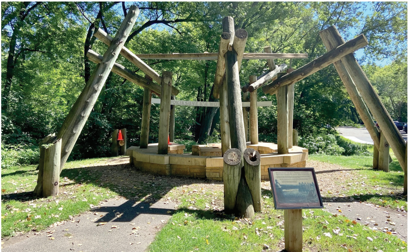
The Dakota Memorial, established in 1987 in Fort Snelling State Park. KATRINA M. PHILLIPS, AUGUST 2022

There are no blacksmith demonstrations or artillery explanations. The rustling trees and birds are only matched by the cars humming along the bridge above us. There are no boisterous school groups or field trips here. It's just Leo