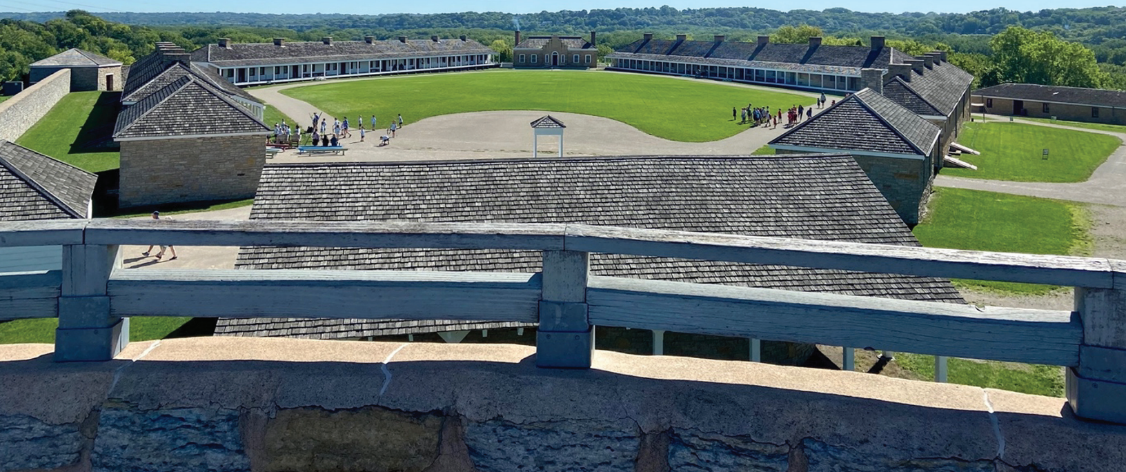
A view of the fort's interior taken from the top of the famed round tower. KATRINA M. PHILLIPS, AUGUST 2022

Lower Sioux Agency, which was established in Morton as a government agency in 1853 and the first site attacked by Dakota warriors in August of 1862. Fort Ridgely in Fairfax came under attack a few days later. The final related site is Traverse des Sioux, home to one of the 1851 treaty signings that led to the war.