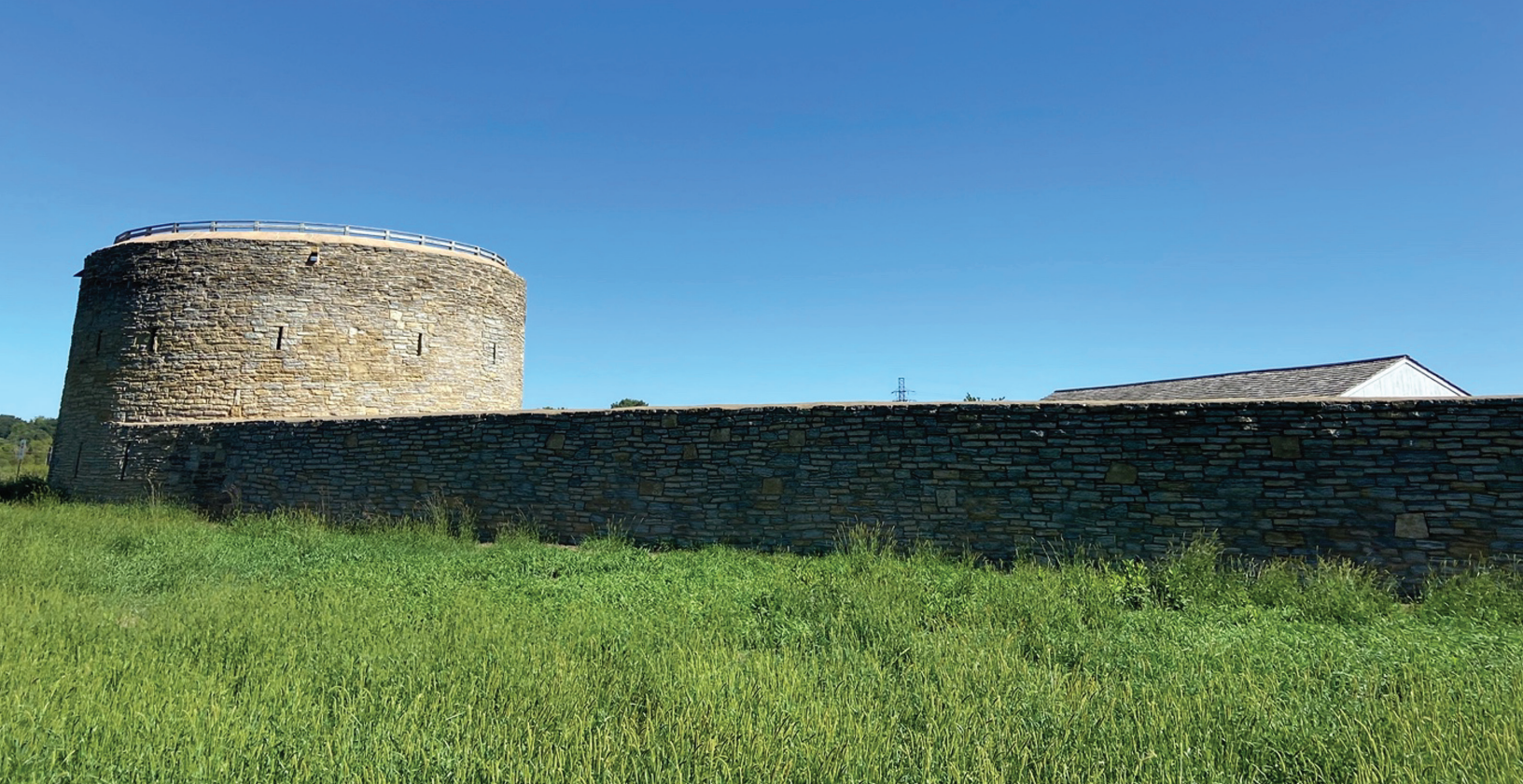
Historic Fort Snelling's famous round tower.

Parts of four volunteer regiments were forming at Fort Snelling, to serve the Union in the Civil War. Col. Henry Sibley redirected four companies to the combat zone in Minnesota. Other companies soon followed.