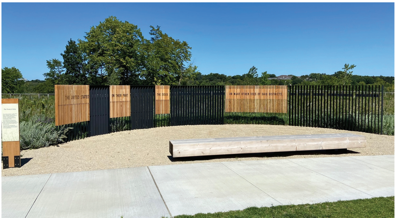
1805 Treaty installation at Historic Fort Snelling.