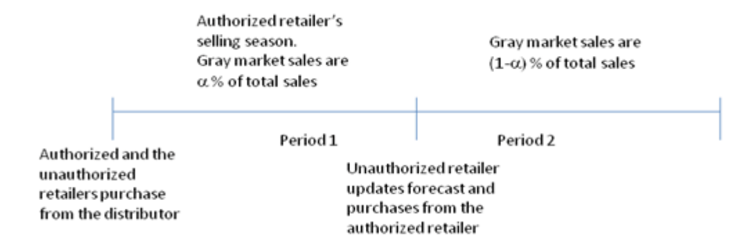
Figure 3. Sequence of events in a channel with a distributor and two classes of retailers