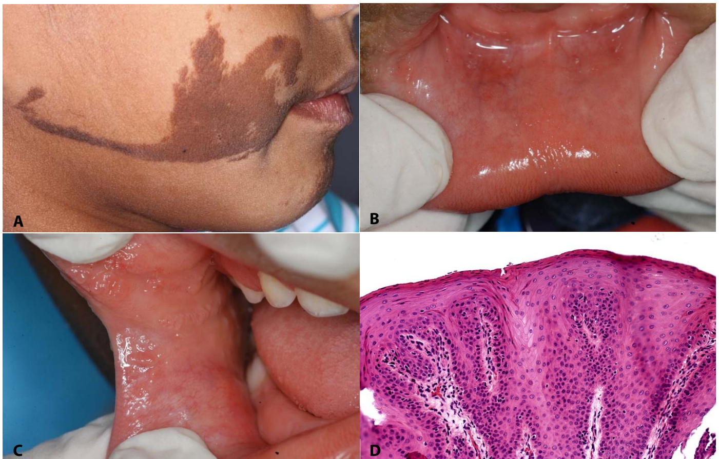
Figure 1. A) Hyperpigmented verrucous linear plaques end abruptly at the midline. B, C) Pink verrucous lesions inside his lower lip and at the right buccal mucosa. D) Oral biopsy revealed hyperkeratosis, acanthosis, and papillomatosis. H&E, 200x.

The prevalence of epidermal nevi is 0.1 to 0.5% and there is no predilection for gender or race [2]. The incidence of all types of epidermal nevi is estimated to be one in 1000 live births. Most lesions arise