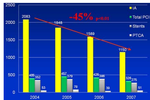
Fig. 2 Utilization of invasive procedures from 2004 to 2007. The number of invasive coronary angiogram fell 45% between the years 2004 and 2007 following the implementation of CCTA in the year 2006. However, the incidence of PCI remained stable

Over this time, increased utilization of CCTA was associated with a significant 45% decrease in ICA procedures (2,083 in 2004 vs. 1,150 in 2007,