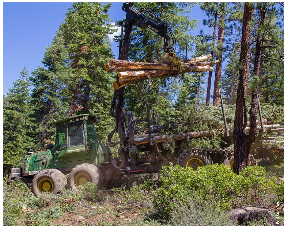
A forwarder collects forest slash for chipping at the U.S. Forest Service's Yeti Fuels Reduction project near Lake Tahoe.

The ability for California's forest landowners to generate revenue by producing wood and forestry