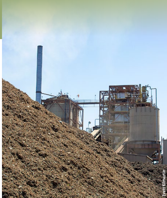
A mound of woody biomass at Buena Vista Biomass Power near Lone (Amador County).

California's biomass-fueled power generation industry grew rapidly from the 1980s through the mid-1990s. At the peak, close to 1,000 MWe were installed and operational. These plants, ranging in size from 7 to 50 MWe, were typically built either alongside lumber mills — so as to utilize sawdust and off-cuts from the mill and logging slash produced from harvesting — or as stand-alone plants, utilizing the wood fraction of urban waste streams (construction debris, tree prunings, etc.) and wood from orchard removals or other agricultural activities. In most cases, these plants serve the dual purposes of producing electricity and providing an alternative to incineration or landfilling of forestry, agriculture and municipal biogenic waste. In this way, the biomass energy industry has facilitated air quality improvements, landfill diversion and forest health.