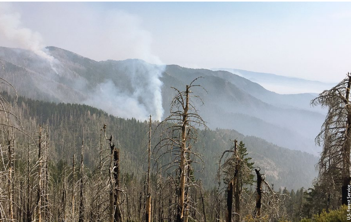
The Gasquet Complex Fire, which was caused by lightning in the Six River National Forest in California on Jul. 31, had consumed over 30,000 acres as of Sep. 14.

Biomass power plants create a market for small trees, limbs and treetops — or what people in forestry call "slash" — generated by forest management operations such as fire hazard reduction treatments. However, the cost