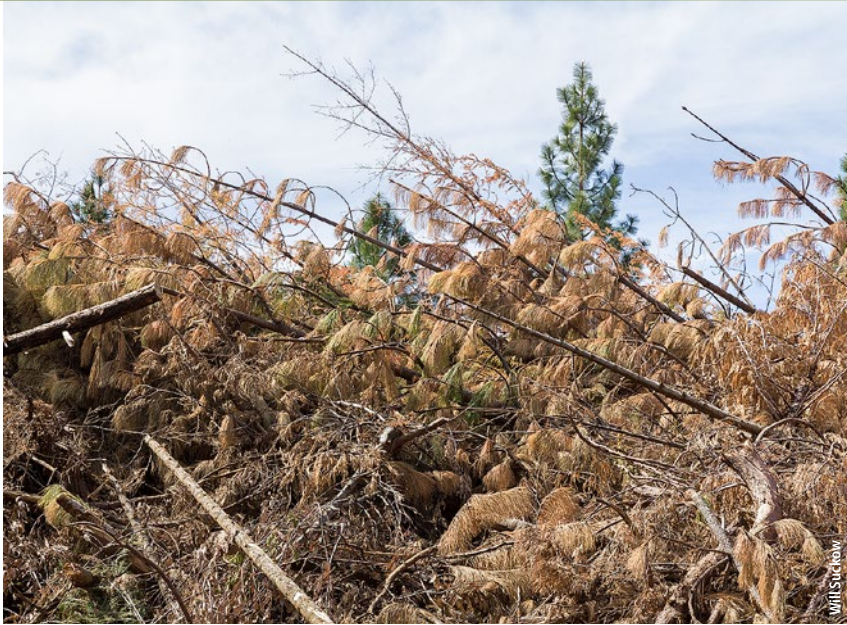
Forest slash is piled following a thinning treatment at the UC Blodgett Forest Research Station in El Dorado County.

of conducting such treatments generally far exceeds what power plants are willing to pay for biomass fuel. Thus, while revenue from selling slash to power plants helps land managers by offsetting a portion of forest treatment costs, it does not provide a profit motive for increasing extraction of biomass from forests simply to supply power plants.