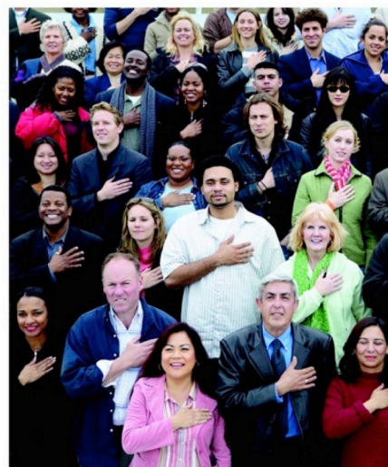
SWEARING IN NEW CITIZENS

"Immigrants contribute to our society in a number of ways. Cities and neighborhoods with greater concentrations of immigrants have much lower rates of crime and violence than comparable nonimmigrant neighborhoods. Evidence also shows that immigrants contributed an estimated $115.2 billion more to the Medicare Trust Fund than they took out in 2002–09. Undocumented immigrants nationally will add $276 billion to social security over next 10 years but cost only $33 billion."