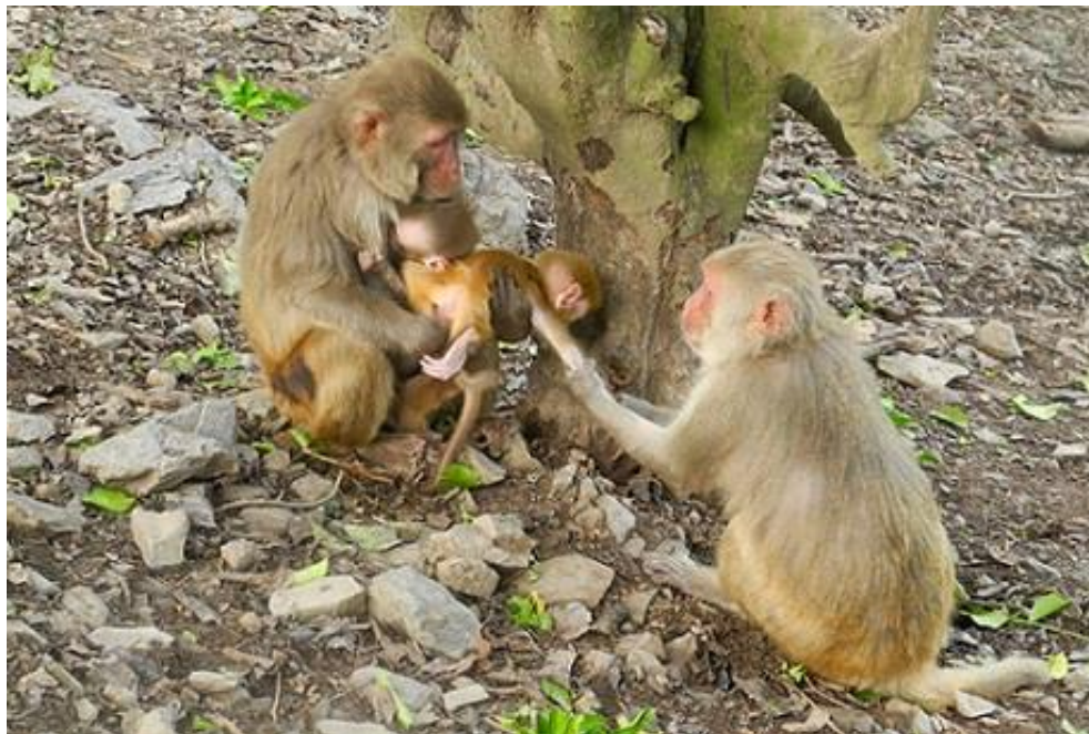
Figure 2. A female rhesus macaque attempts to retrieve her infant from a higher-ranking handler.