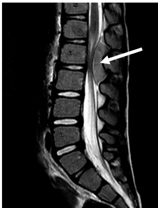
Figure 1. Spinal MRI of a patient with spinal cord compression by neuroblastoma tumor mass. A sagittal T2-weighted image demonstrating the tumor mass (white arrow) is shown.

occasionally associated with ataxia. Symptoms of OMA syndrome often persist after resection, and can also be associated with dramatic long-term motor impairment, speech and language delay and significant cognitive dysfunction [36,37].