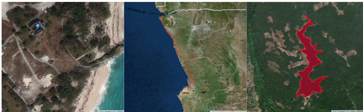
Fig. 3 Examples of point, line, and polygon footprints. Left to right: Rehabilitation of Sam Lord's Castle, Barbados; Soyo-Kapary Electrical Transmission and Transformation Project, Angola; Kirirom III hydropower plant (reservoir), Cambodia.

As with other researchers in this space 7,8,21 we understand that individual projects within such funds can be hidden from public view until the line of credit or framework agreement is renewed or laid down unused. Thus, we include such financing agreements when they are initially drawn up, but then withdraw them from subsequent updates if it comes to light that they were unused. If they are renewed, as lines of credit frequently are, such renewals do not represent new financing but simply a relaxation of the time period for use of the original commitment. For this reason, renewals are not considered separately.