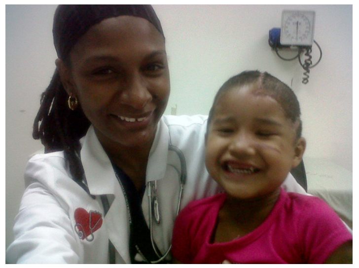
Figure 5. Child in the clinic prior to discharge (published with written parental permission).

A jaguar's typical lifespan in the wild is around 12 to 15 years; in captivity they live up to 23 years.<sup>11</sup> Human population growth inevitably leads to jaguar population decline and eventual local extinction. This stems from deforestation and fragmentation of their habitat with barriers.<sup>6</sup> Both are occurring in the region in which this attack occurred. Jaguars also are killed by ranchers and farmers to protect their livestock or out of fear, and by professional hunters for their skin and other body parts.<sup>6</sup> The jaguar is considered "near threatened"<sup>12</sup> or "endangered,"<sup>13</sup> and all commercial trade is prohibited.<sup>14</sup>