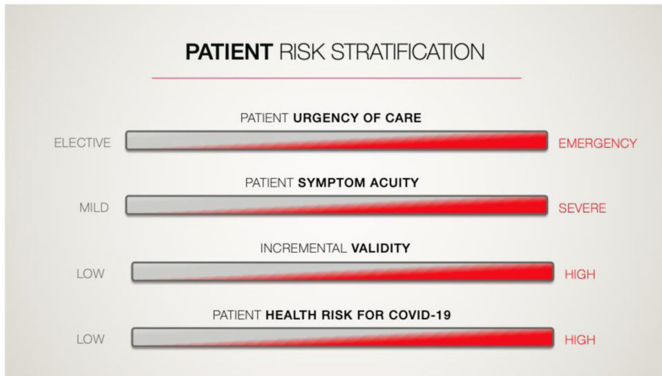
Figure 1. Patient risk stratification.