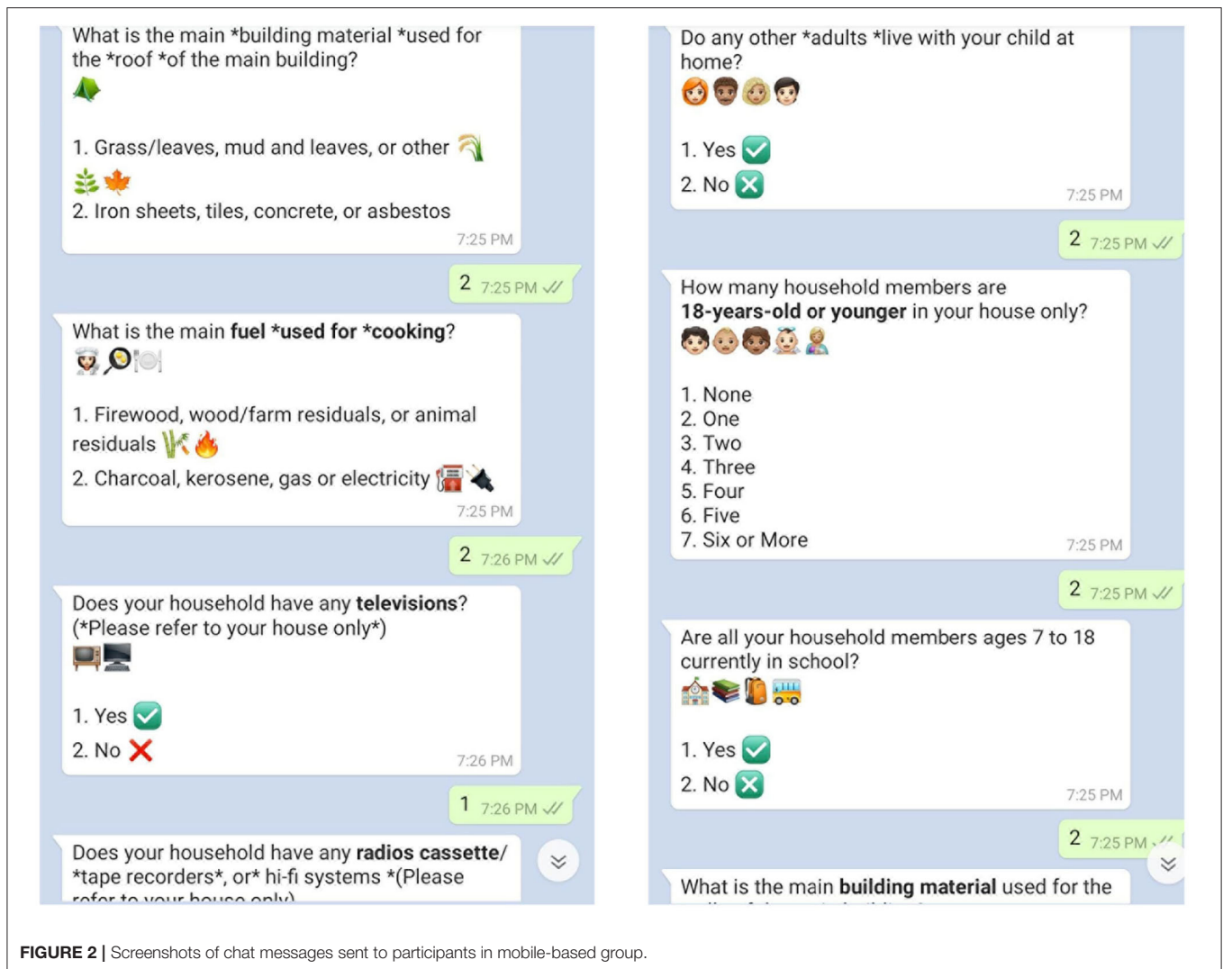
FIGURE 2 | Screenshots of chat messages sent to participants in mobile-based group.

the intervention, participants will receive reminders of upcoming episodes and short public health messages delivered via WhatsApp. Parent/caregiver-VYA dyads will receive honoraria in the form of internet data credits worth 1.72 USD upon completion of each week's activities. Figure 3 illustrates the study design, intervention components and anticipated timeline.