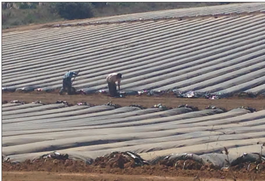
Workers maintaining a bed fumigation.

fumigants. Table 4 shows growers' responses to an interview question about their main challenges. When growers were asked to identify the main challenges to the viability of their operations, virtually every grower who gave a response mentioned the labor shortage, while comparatively few identified increasing regulatory burdens as one of their main challenges. This suggests that the labor shortage is a significantly more pressing concern for growers than increasingly strict mitigation measures or the potential phase out of soil fumigants. One grower's comments summarized the sentiments of several others: "The problem has nothing to do with fumigation. It's a labor shortage...there's not enough people to pick."