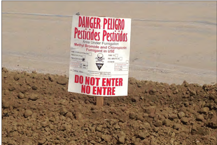
Warning sign at the edge of a fumigation.

Fieldworkers, by contrast, view the pesticides used at their worksites as