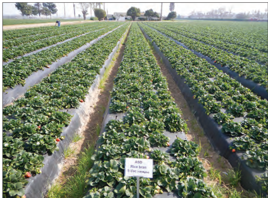
Anaerobic soil disinfestation (ASD) trial plots.

On the whole, conventional growers continue to opt for traditional chemical fumigants in lieu of implementing more agro-ecological and integrative approaches. Our review of pesticide use data from 2004 to 2011 shows that rather than scaling up their use of these alternative technologies, growers are generally choosing to increase their rates of chloropicrin application to compensate for the loss of methyl bromide. Growers are hesitant about scaling up the use of what they see as technologies still in the development rather than the commercial adoption phase, particularly in the context of challenges like lack of labor and drought that constrain their capac-