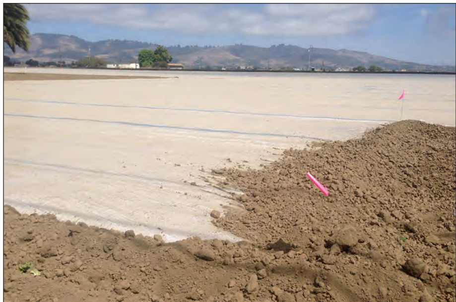
Dirt used to hold down protective tarps.

California strawberry growers appear to be experiencing an unusual labor shortage. The shortage owes to both heightened militarization of the border since 2001 and the pull of less arduous jobs in other crops and other industries. Growers widely complain about a lack of labor (Hertz and Zahner 2013; Tourte et al., 2016). One of the more interesting findings of this research is that the current agricultural labor shortage is much more concerning to strawberry growers than increasing regulations on soil