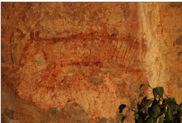
Figure 4. Indigenous rock art depiction of a thylacine at Ubirr Rock.

The report also declares a tiger was sighted on an island in the third bay they explored, viz. the island marked Waterplaets ('Watering place', present day Greenhill Island) in Driebergens Bocht ('Three Mountains Bay', present-day Van Diemen Gulf) (Figures 1b & c, reference G ). An excerpt from the report is given in Figure 3.