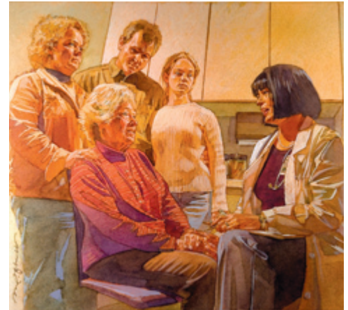
ILLUSTRATION BY MARK SCHULER