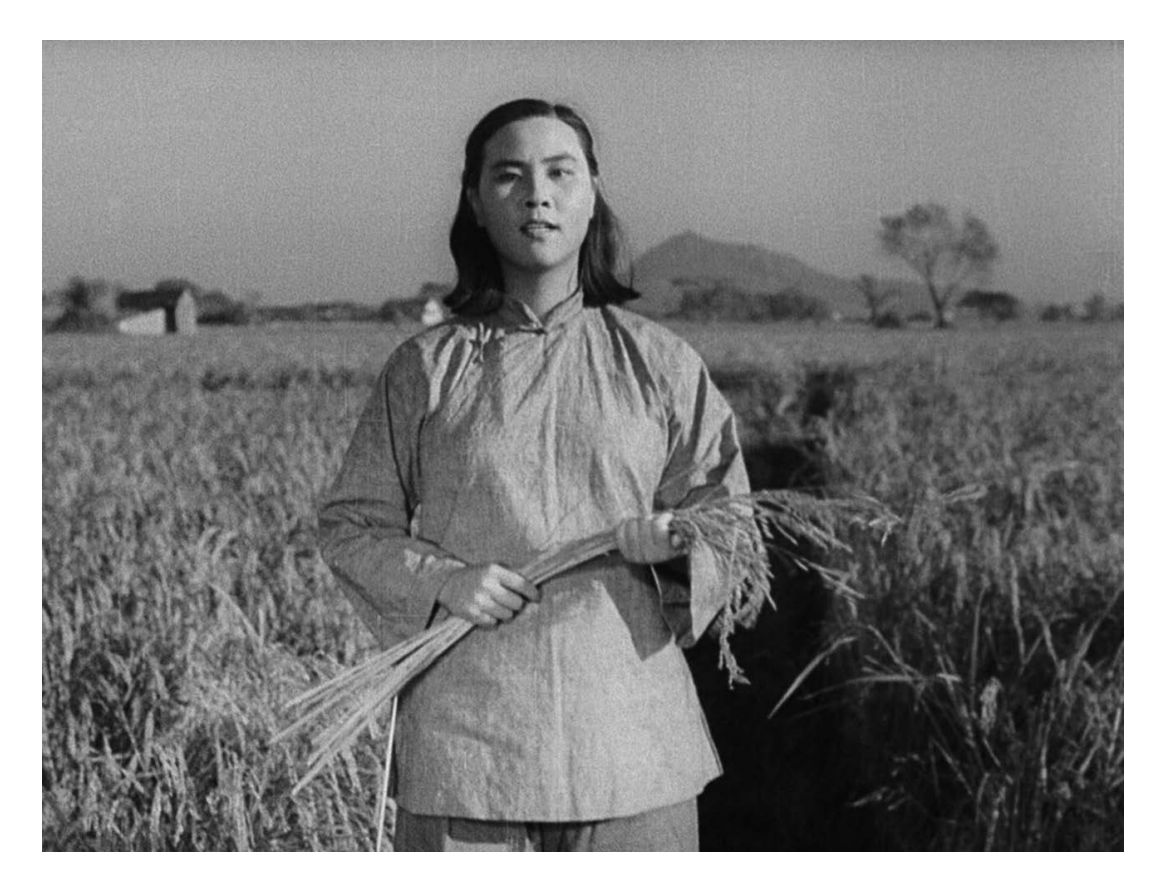
Figure 6.3 The main character Chen Hsiu Hua in the Chinese segment. © Die Windrose, DEFA-Stiftung / Joop Huisken, Robert Menegoz.

character of the projects by preserving the national idiosyncrasies of the five episodes."<sup>56</sup> However, the voiceover of the Chinese segment drastically differs from those in the other four segments. The narrators in the Brazilian, Russian, French, and Italian stories adopt a third-person point of view, summarize the actions on screen, and paraphrase the majority of the heroines' monologues. The voiceover in the Chinese segment, by contrast, is attributed to a minor character in the diegetic world—Hsiu Hua's elderly mother, who only appears for several seconds in the film, remains unnamed, and only has two lines in Mandarin. The decision not to fully paraphrase the plot and the dialogue from a third-person point of view was not a result of linguistic barriers in this case, since DEFA had a complete script of the Mandarin dialogue accurately translated into both English and German.<sup>57</sup>