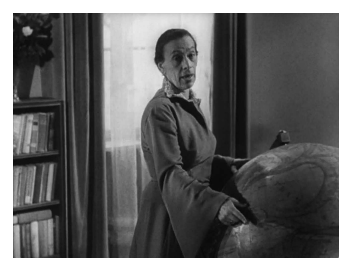
Figure 6.2 Weigel points to each country on the globe.

toward a large compass rose shot in close-up and connects this symbol to the five heroines: