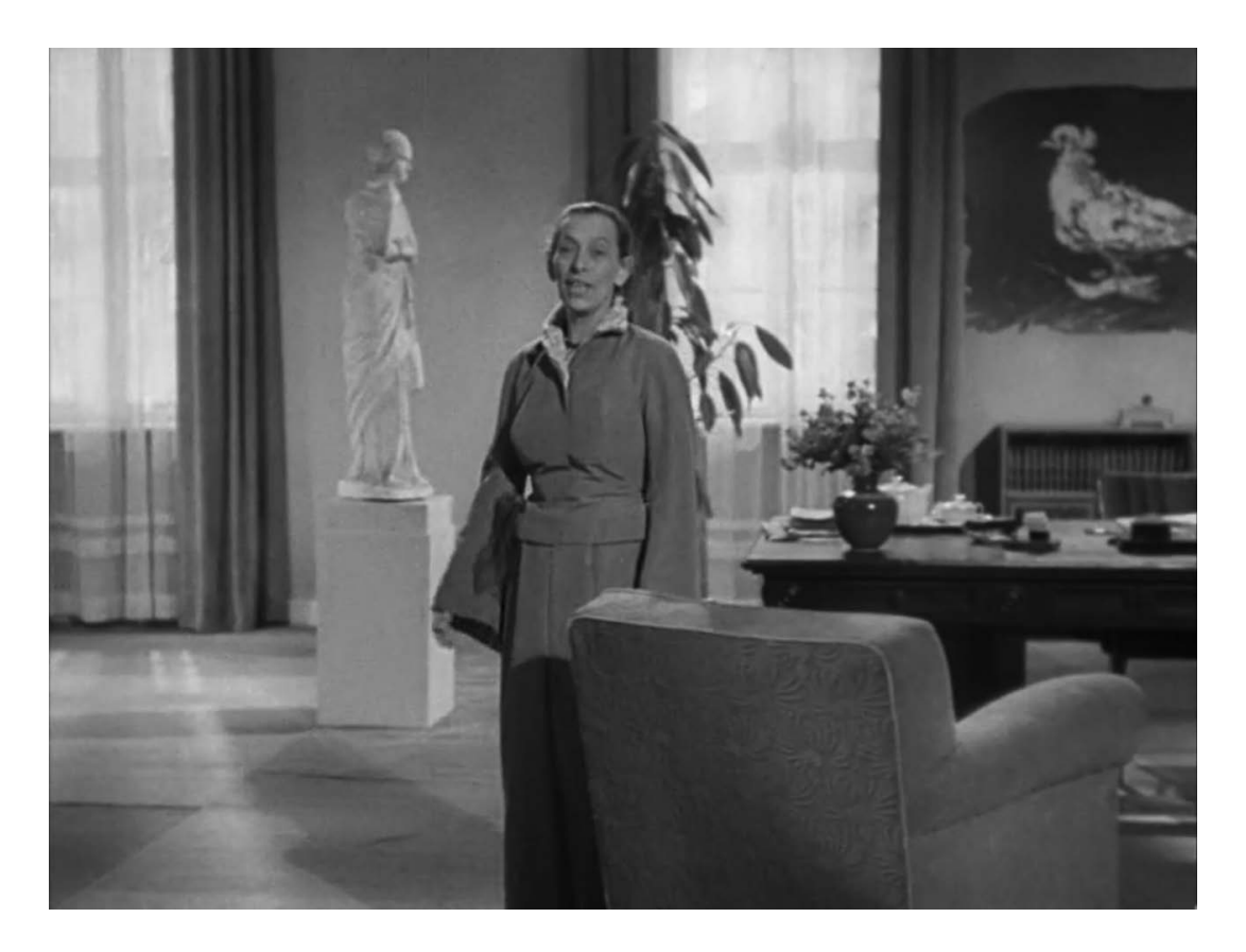
Figure 6.1 Helene Weigel in the opening scene.

and [addresses] particular sexist cultural practices from an otherwise Eurocentric women's studies gaze."48 Weigel's promise of a short, easy excursion defines the audiences' interactions with the foreign characters as superficial spectatorship, similar to a visitor's experience in an ethnographic museum of world cultures, rather than a deep, invested engagement with the characters' specific struggles. This "feminist-as-tourist model" often has the effect of leaving the audience with "a clear sense of the difference and distance between the local (defined as self, nation, and Western) and the global."49 Indeed, in the absence of an East German story in this anthology film, Weigel herself represents the GDR. The distinction between "us" and "them" literally becomes the distance between Weigel's body and the model of the globe, which incorporates Brazil, Italy, France, the USSR, and China. The ease with which Weigel points out each country at her fingertips both conveys East Germany's cosmopolitanism and hints at the GDR's cultural superiority as the provenance and commander of this world cruise (Figure 6.2).