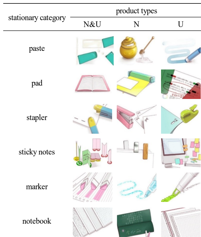
Table 1: Overview of the evaluation materials. “N&U” represents Novel and Useful products, “N” represents Novel products, and “U” represents Useful products.

awareness, and Product N, which had high awareness, the final evaluation set consisted of a total of 18 products in six categories (Table 1).