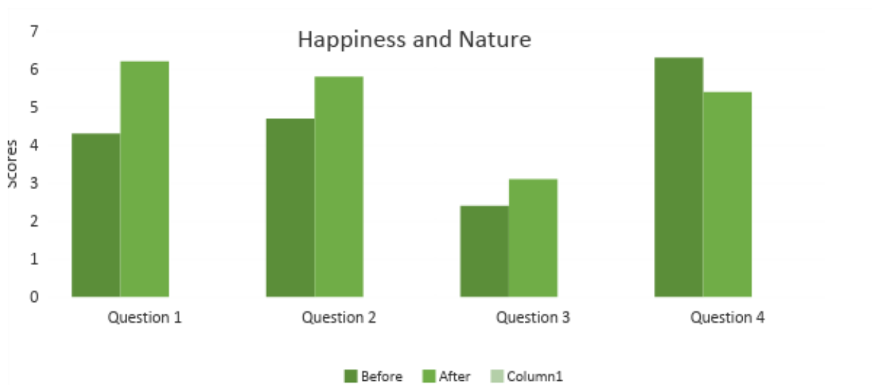
Figure 2. Results of Subjective Happiness Scale before and after spending an hour in nature

Figure 2 shows the results of the experiment. The results show a slightly significant increase in overall happiness after spending an hour in nature. On average, the participants rated higher on feeling happier as well as believing they are happier than most of their peers (questions 1 and 2). The results also show a slight increase in believing that everyone is happy (question 3) and a slight decrease in believing that everyone is not happy (question 4).