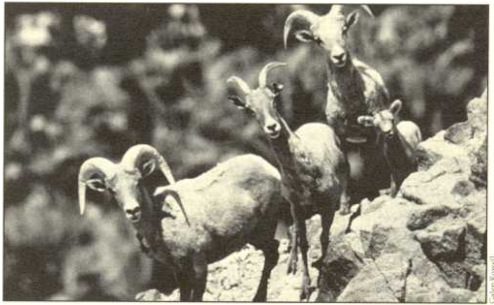
Desert bighorn sheep, a state-listed rare species, are the subject of a long-term monitoring and research program sponsored by the Dept. of Fish and Game at the Granite Mountains Reserve.

Proposal deadlines are March 25 for projects between November 1988 and April 1989 and September 16 for projects between May and October 1989. For information on applying, or for a catalog of 1988 expeditions, contact UREP, University of California, Berkeley, CA 94720, (415) 642-6586.