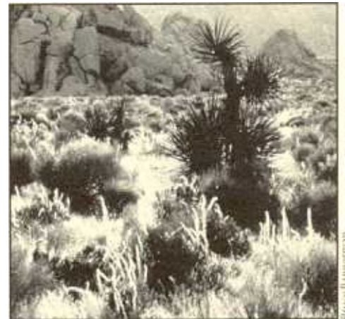
The Granite Mountains Reserve is one of the NRS sites used by the Dry Lands Institute.

The DLRI is in an environment suited for basic and applied research addressing the challenging problems facing the inhabitants of dry lands. It is centrally located in the dry interior of Southern California in the transition zone between sub-humid and semi-arid areas. Extremely arid low desert, high desert, dry forest, and shrub lands are all within easy reach. The DLRI makes use of UCR's 615-acre field experiment station and the 835-acre Moreno Ranch site within five miles of campus. The University's 37-acre Botanic Gardens maintain an extensive collection of dry land plant species from