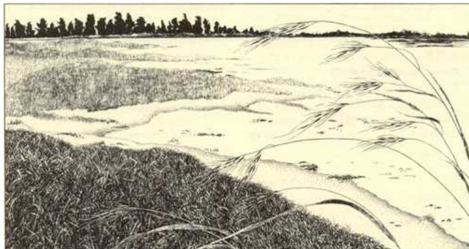
Looking northeast across Olcott Lake, a large vernal pool at the Jepson Prairie Reserve. Public tours of this site will be available this spring.

Two NRS publications received awards this year. Natural Reserve System: The First Twenty Years won an award of achievement from the Society for Technical Publications. It also received a silver medal from the Council for Advancement and Support of Education (CASE) in the photocommunications via print category for the images by Galen Rowell. This 4-color, 24-page booklet describes the purpose and history of the NRS, and highlights various teaching, research, and public service projects based on reserves. In addition, the Transect received a bronze medal from CASE in the internal periodicals division. Both publications are available at no charge from the systemwide NRS office (see back page).