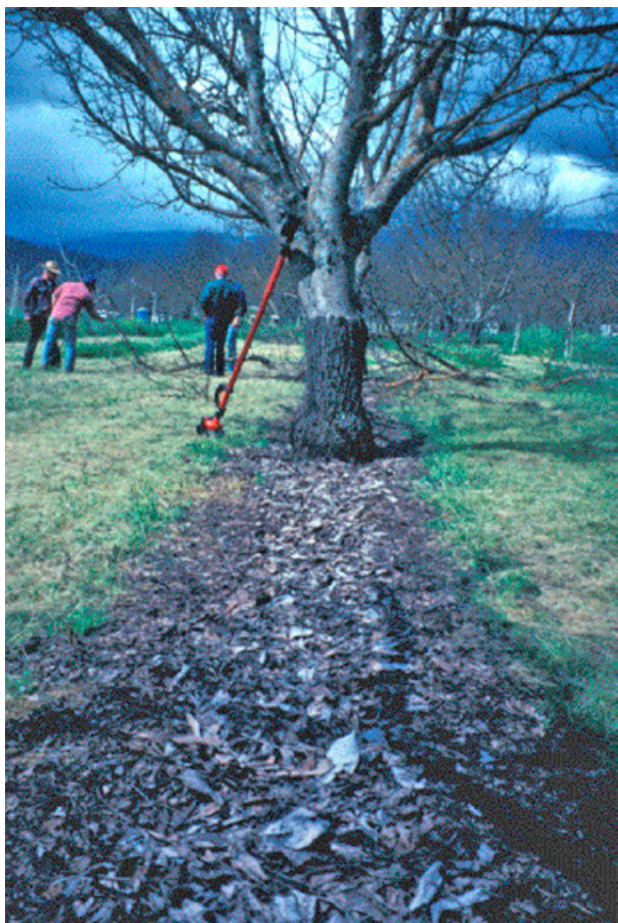
Figure 4. Walnut leaf mulch in walnut orchard rows, Lake County.

Mulch can consist of organic or inorganic materials. Examples of inorganic mulches are gravel, pumice, stone, and sand. Organic mulches usually are undecomposed materials such as rice hulls, wood chips, leaves, sawdust, and straw. Mulch protects the soil against raindrop impact and compaction, both of which destroy soil aggregates. An added benefit of mulch is that it reduces water loss to evaporation and so extends the period of time between irrigation events. In addition, mulching is an effective weed suppressant practice and can reduce herbicide usage (Figure 4). Mulch is best suited for sprinkler- or drip-irrigated