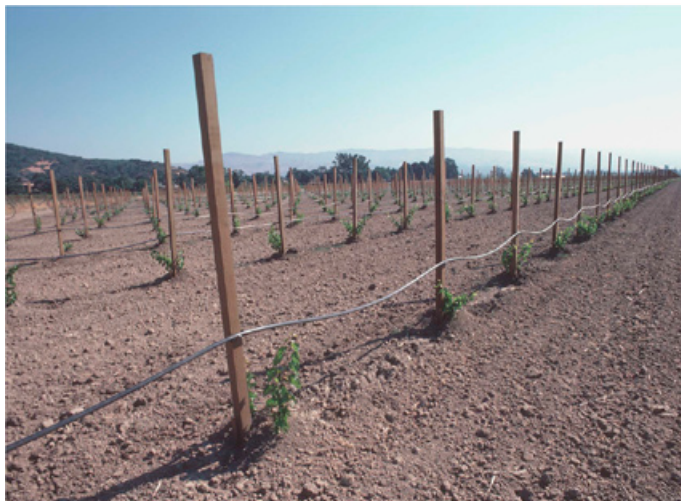
Figure 2. Example of a well-aggregated soil as indicated by the various sizes of surface aggregates.