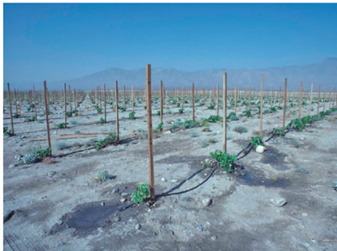
Figure 3. Example of a soil with poor structure and surface crusting. Note how the surface crusting causes irregular wetting patterns and the development of sheet and rill erosion. The impact of wheel traffic is visible at the lower left corner.

(O’Geen and Schwankl, 2006). In addition, stable aggregates resist particle detachment, prevent the formation of crusts, and are less susceptible to compaction. The significance of well-aggregated soil is further summarized in Table 1 .