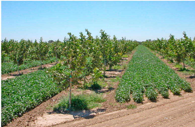
Figure 5. A legume cover crop in California's Central Valley.

According to the US Environmental Protection Agency, agricultural grades of PAM must contain less than 0.05% of the acrylamide monomer. In addition, PAM rapidly degrades when exposed to sunlight and through decomposition from soil microorganisms (Cahn et al., 2004).