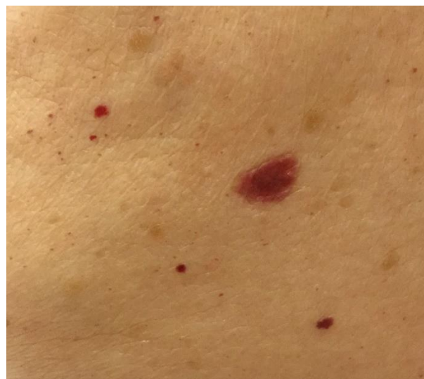
Figure 1. Clinical presentation. Red-violaceous plaque on the flank.

plaque on the left lower flank. The color was not uniform throughout the lesion; it was red peripherally and a darker violaceous color centrally. There was no history of trauma, intraslesional steroid injection, or application of topical steroids. Surrounding the lesion were multiple additional small red papules ( Figure 1 ). The patient's medical history included squamous cell carcinoma treated with 5-fluorouracil and Sjogren syndrome treated with oral hydroxychloroquine and ophthalmic suspensions of loteprednol etabonate and latanoprost. The initial clinical differential diagnosis included basal cell carcinoma and amelanotic melanoma. A shave biopsy of the plaque was performed.