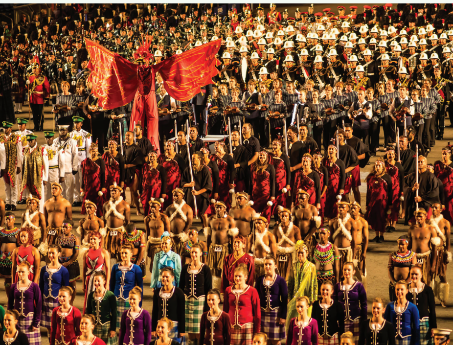
The Royal Edinburgh Military Tattoo annually displays human diversity.

We can learn everything we need to know to sustain life and thrive on this planet by understanding the best-preserved remnants of nature in national parks, sanctuaries, refuges, and allied protected reserves on land and in the sea. If we learn to understand unimpaired nature, we can better diagnose complex environmental health issues, test effective remedial treatments, and apply the best modalities to sustain life, including our own, and thrive on Earth.