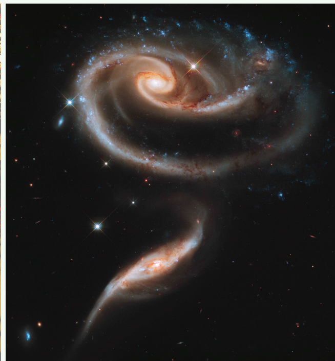
A “rose” made of galaxies.