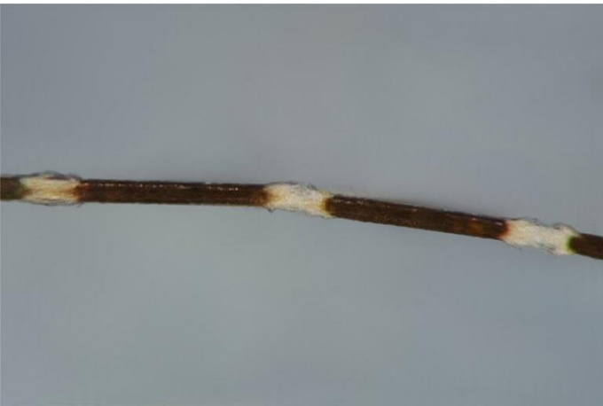
Figure 3. Acquired trichorrhexis nodosa, trichoscopy with videodermoscopy. Broken hair stems in multiple foci are evident. (Non-polarized mode, 70 \times ; FotoFinder ® ).

in great detail the loss of cuticle along with frayed cortical fibers, a characteristic image that mimics two brushes crushed and opposing each other ( Figure 5 ). The diagnosis of acquired trichorrhexis nodosa was reaffirmed by the good clinical response after a two month avoidance of topical irritants on his hair.