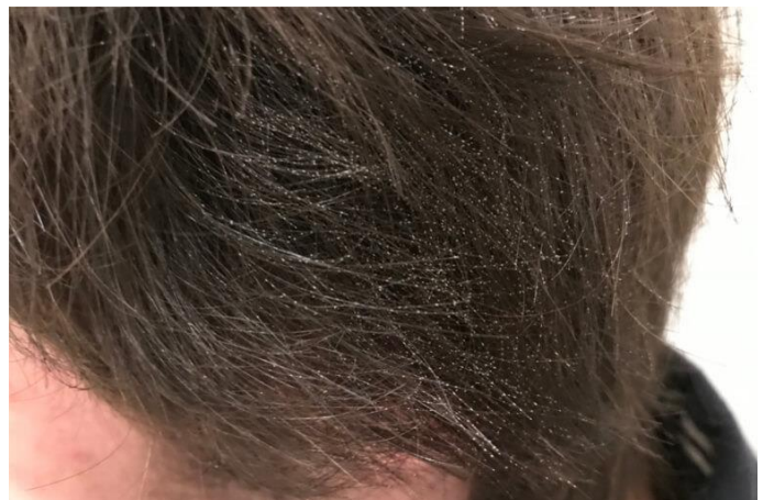
Figure 1. Acquired trichorrhexis nodosa, clinical presentation. Multiple small whitish nodules in the hair stems.

An 18-year-old man, with no relevant medical history, attended our hospital with a three-month history of increased hair fragility and multiple tiny whitish nodules, mainly in the distal segment of the hair of the temporal regions ( Figure 1 ). There was no evidence of any underlying skin disorder. The patient reported washing his hair several times a day and using various cosmetic products for topical application. Trichoscopy using a dermatoscope with non-polarized light and a magnification of 10x, showed multiple whitish nodules in the distal part of the hairs ( Figure 2 ). The diagnosis of acquired trichorrhexis nodosa was established and suspension of chemical irritants was recommended. For academic purposes, some hairs were extracted for complementary examinations. Trichoscopy using videodermoscopy was performed (non-polarized mode, 70x magnification), showing the presence of broken hair shafts in the affected areas ( Figure 3 ). Optical microscopy (40x magnification), showed the characteristic image of two paint brushes thrust together, in the affected areas ( Figure 4 ). Scanning electron microscopy (390x magnification), showed