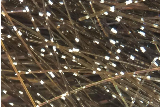
Figure 2. Acquired trichorrhexis nodosa, trichoscopy. Multiple whitish nodules in the hair stems are evident. (Non-polarized mode, 10 \times ).