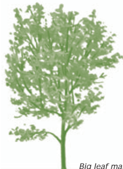
Big leaf maple