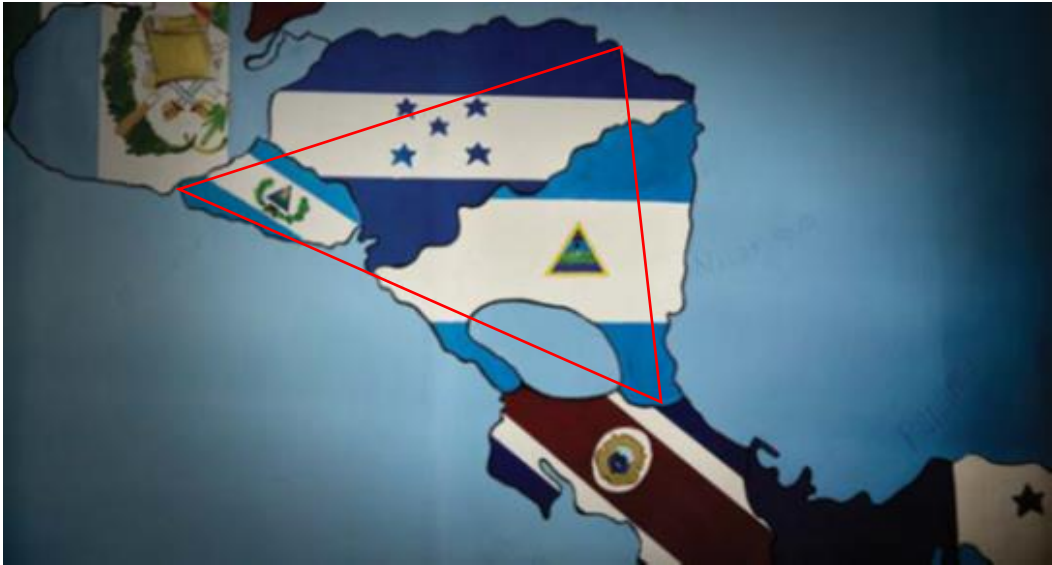
Figure 1: Map of the Central American countries of Guatemala, El Salvador, and Honduras with the red triangle overlay to depict a visual representation of why the countries are collectively referred to as the Northern Triangle region. Adapted from a map of countries presented by United Nations High Commissioner for Refugees (UNHCR). (2015). Women on the Run: Firsthand Accounts of Refugees Fleeing El Salvador, Guatemala, Honduras, and Mexico, A Study Conducted by the United Nations High Commissioner for Refugees (13).

It is important to understand that although these countries share commonalities, their history, socioeconomic make up, and political structures differ in how those systems sustain the oppression and marginalization of women and enforce gender-based violence. Guatemala, Honduras, and El Salvador have a long tumultuous history, these countries have experienced decades long civil wars and political unrest. Women in these countries have been exposed to and have experienced several forms of war related trauma and political violence. Those forms of trauma include large massacres, assassinations and executions, sexual violence, i.e., rape, torture, reproductive health violations, and government