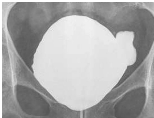
FIG. 3. Postoperative VCUG showing significant reduction in diverticulum size at full bladder distension with minimal post void residual urine volume.

Acquired bladder diverticulum is the result of BOO necessitating high-pressure voiding. After the correction of the BOO, the bladder diverticulum requires intervention in the presence of incomplete emptying, recurrent infection or pain; all of which this patient experienced. Diverticulectomy was