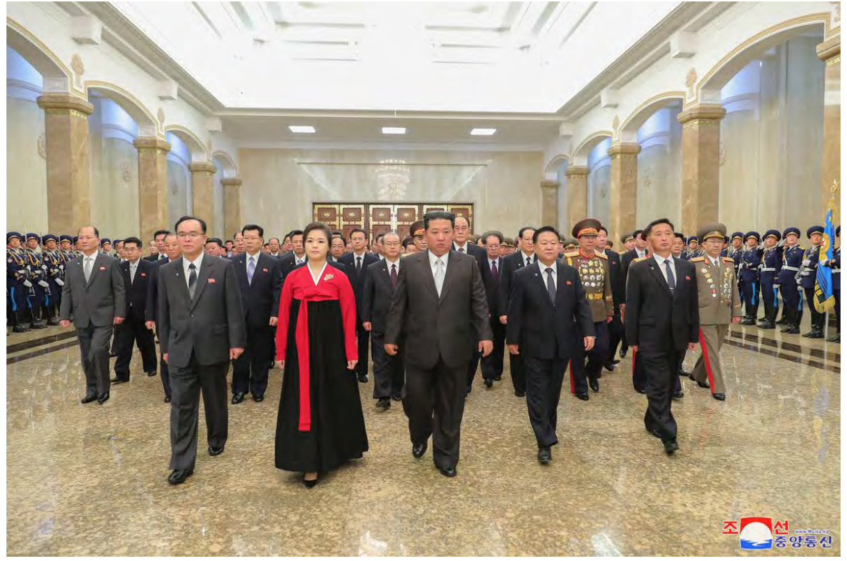
Figure 3.5: Ri Sol Ju, Kim Jong Un, and members of the politburo visit the Kumsusan Palace of the Sun, where the late Kim Il Sung and Kim Jong Il lie in-state.