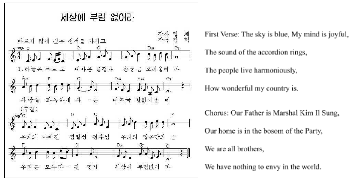
Figure 2.1: Score and first stanza of "We Have Nothing to Envy in the World."

question society. "Nothing to Envy" is deliberately intended for an audience that has not learned how to think independently and are expected to obey elders. This is how many North Korean children are able to believe that they live in the greatest country in the world, yet experience frequent power shortages, not be unfamiliar with malnutrition, and live in constant terror from the regime.