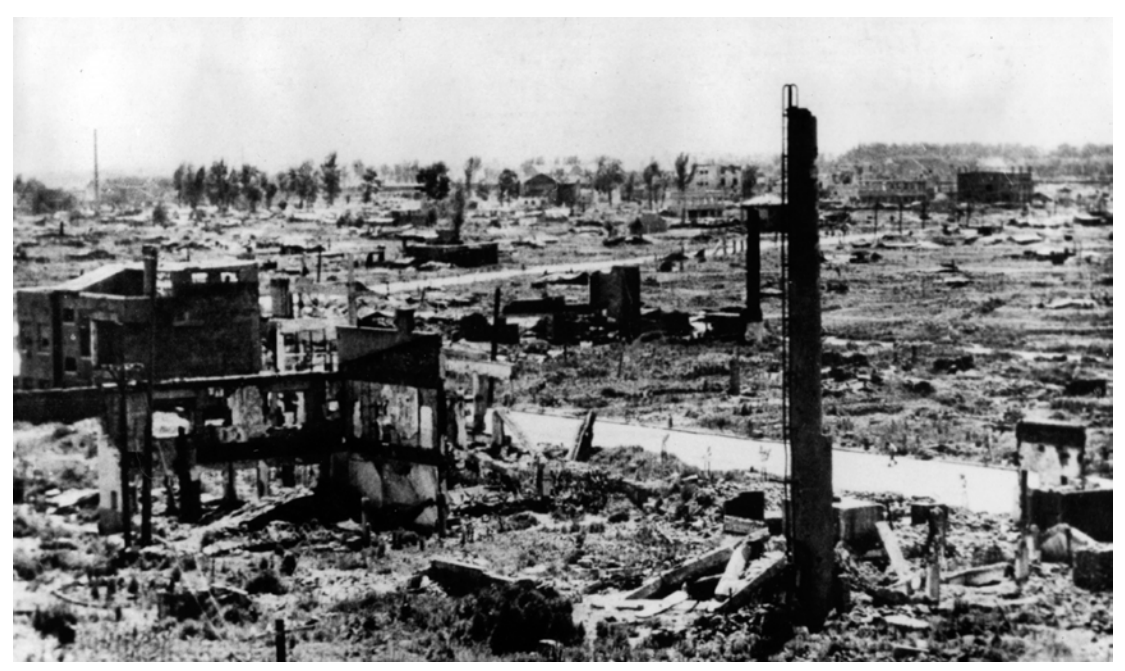
Figure 1.2: A photo of Pyongyang after American bombing, circa 1951.

Although the Korean War is sometimes referred to as the Forgotten War in the US, it is far from forgotten in North Korea. "The United States dropped more bombs on North Korea than it had during the entire Pacific campaign in World War II," North Korean defector Yeonmi Park writes, "[they] bombed every city and village, and they kept bombing until there were no major buildings left to destroy."<sup>45</sup> Villages were set ablaze at night with napalm to force out guerillas. Irrigation dams were destroyed, inundating villages, cities, railways, highways, bridges, and rice paddies. These bombing targets left North Koreans on the brink of mass starvation, until Soviet aid arrived. In total, the North suffered 2 million casualties, a majority in the conflict, which constituted 15-20% of its population. 47