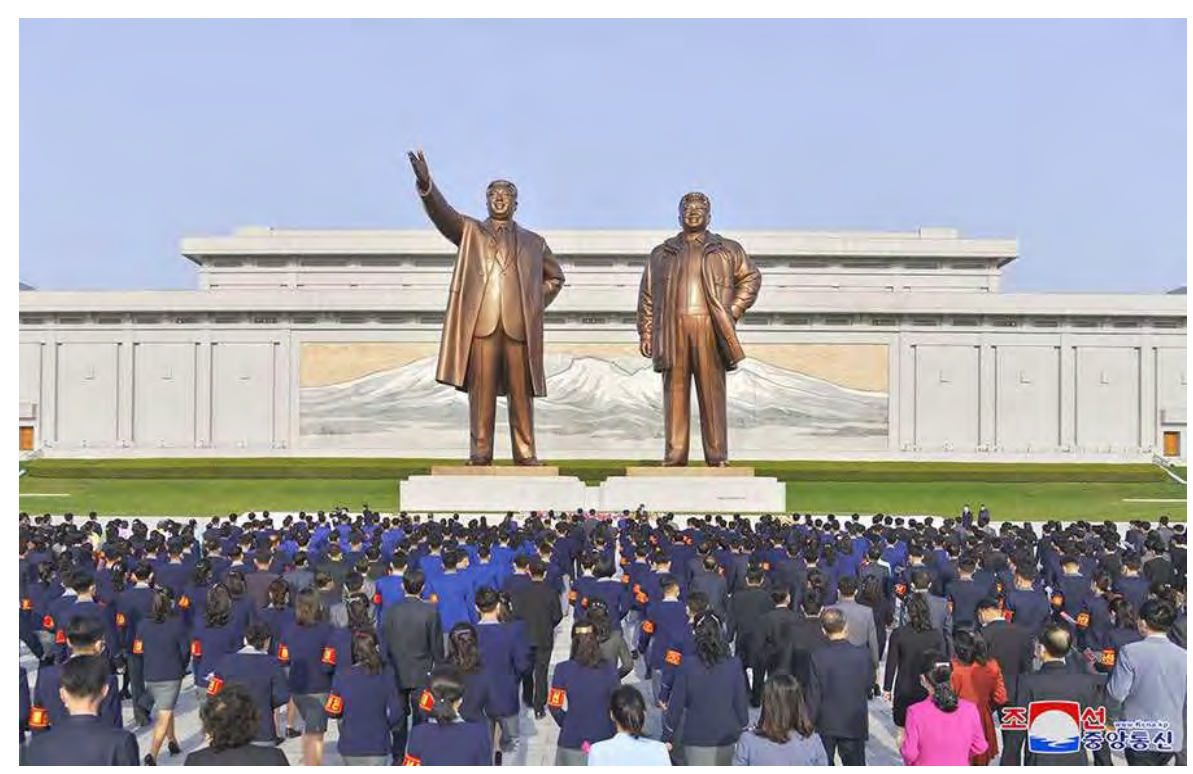
Figure 3.4: "Participants in People's Art Festival Pay Floral Tribute to Statues of Great Leaders."