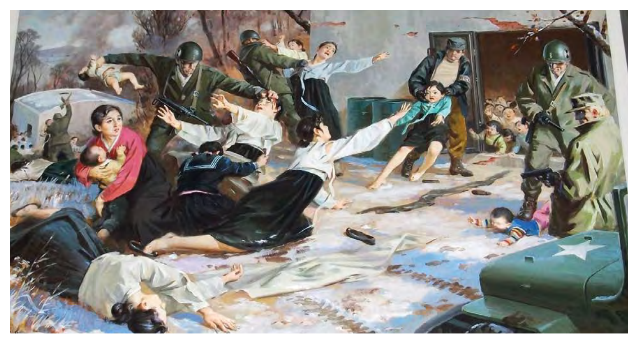
Figure 1.3: A painting from the Sinchon Museum of American War Atrocities. This illustration, of Americans brutalizing Korean women and children, is relatively modest compared to the other exhibits in the museum.