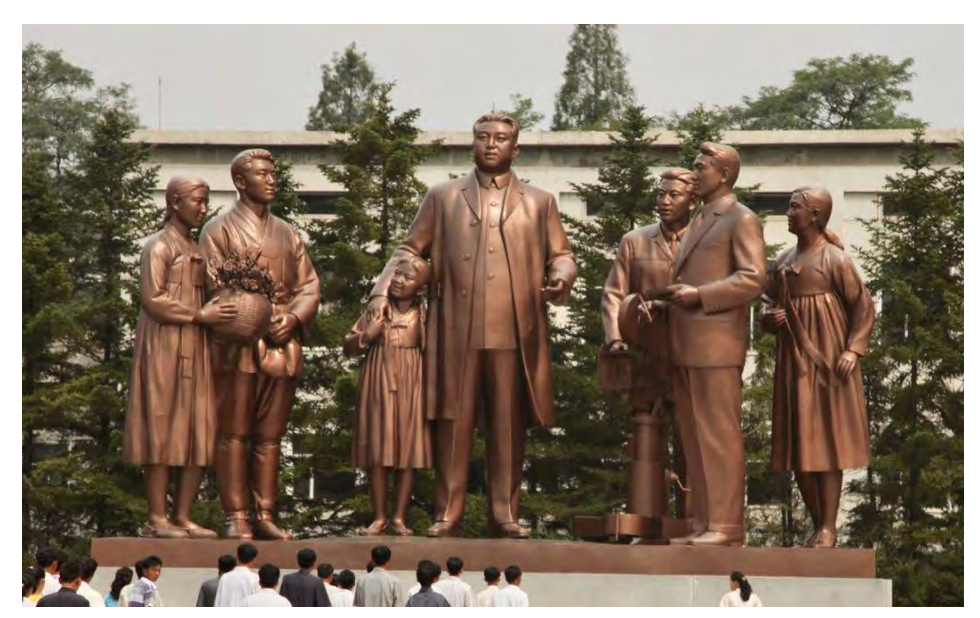
Figure 2.3: A statue of Kim Il Sung with the cast of The Flower Girl at the Korean Art Film Studio in Pyongyang.

feudalism, and imperialism. In the finale that follows, Kkotun walks through the village market, passing out flowers for free to everyone. In the final shot, she walks towards the sun, with a basket full of lavender azaleas, white magnolias (the national flower), and red flowers.