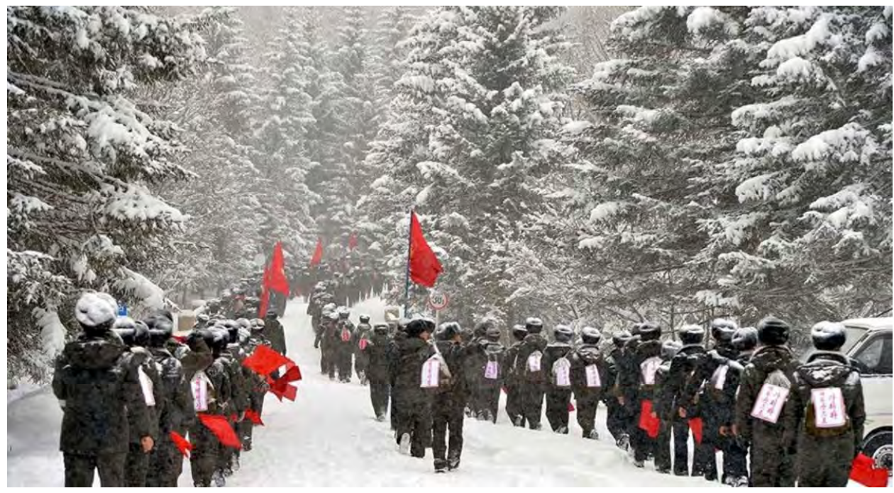
Figure 3.6: Members of the Kimilsungist-Kimjongilist Youth League make their pilgrimage to Kim Jong II's fabricated birthplace at Mount Paektu, the "sacred" mountain of revolution.

One of the most recognizable events that have taken place during the Sun Festival are the Mass Games, which were held annually between 2002-2013 under the name Arirang Festival. They were a symbiotic relationship of arts, acrobatics and athleticism and drew on elements from physical theatre, rhythmic gymnastics, Cirque du Soleil and Broadway musicals, according to Udo Merkel. The Mass Games were resumed in 2018 under the name "The Glorious Country" to commemorate the country's 70th anniversary, then renamed "People's Country" the following year. The last performance of the Mass Games was in 2020, and have been on hiatus since then due to the COVID-19 pandemic. Although the Mass Games have been performed time and time again since the founding of the country, because they have been discontinued, they will not be the main focus of this chapter.