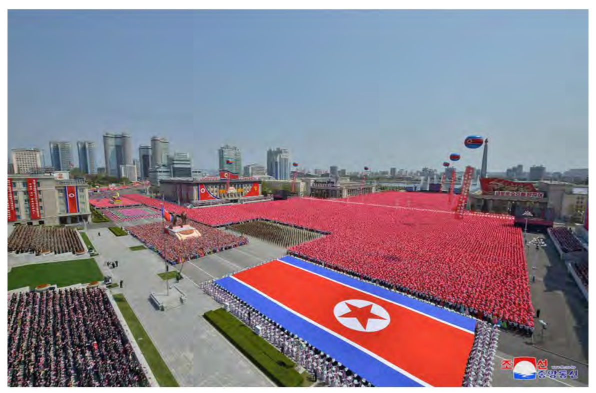
Figure 3.8: Beginning of the 2022 Day of the Sun parade. Ibid.

holding it with one hand while holding synthetic magnolias (the national flower) in the other. The symbolism in this part of the procession has significant implications and the psychological impact it has on the spectators and participants is tantamount to the effects found in conventional religious rituals.