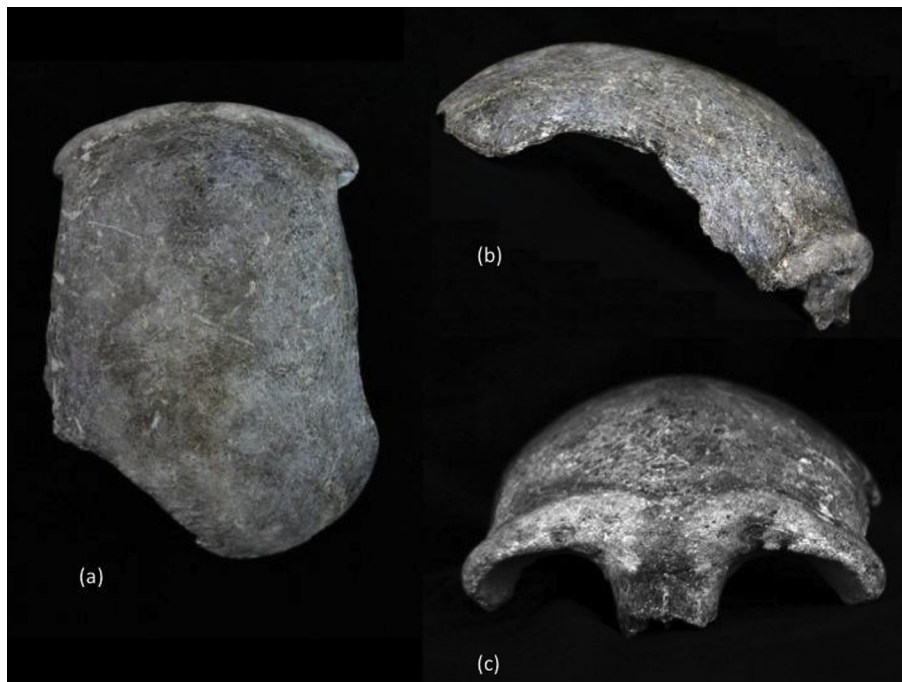
Fig. 1. Salkhit skullcap: (a) superior view; (b) lateral view; (c) anterior view.

When Salkhit is compared with the three specimens in Upper Cave, two specimens, UC 102 and UC 103, have a superciliary arch and do not have a supraorbital torus. UC 101 shows a surprising similarity with Salkhit in many aspects. In both Salkhit and UC 101, the supraorbital bar continues throughout the supraorbital region; the medial portions are thicker than the lateral portions; the supraorbital torus thickens at the lateral end, resulting in a slightly knobbed look. There is a weak but discernible groove that separates the torus into two components, medial and lateral. In Salkhit, the medial and the lateral portions of the left supraorbital are