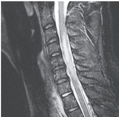
Fig 1 Fat suppressed magnetic resonance imaging demonstrating edema in the cervical spinal cord as a result of root avulsion.

The patient was transferred to our institution for management of possible spinal cord injury.