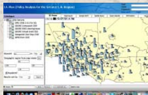
Figure 2. CyberGIS-enabled prototype: Querying the socio-economic properties (population and employment) of model zones