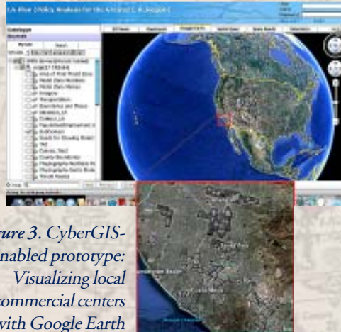
Figure 3. CyberGIS-enabled prototype: Visualizing local commercial centers with Google Earth

This project is undergoing its fundamental research and prototype testing phase. Once launched in the environment of the co-laboratory, the RELU-TRAN model will be capable of examining a variety of policies in the areas of environmental quality, energy use, land use, housing, and transportation, and the interaction of these areas in the regional economy. The modeling of these policies, with feedback between the academic experts on the one hand and practitioners on the other, will result in better and more practically relevant thinking about policy, and the better education of all undergraduate and graduate students who are interested in GIScience, economy, and public policy.