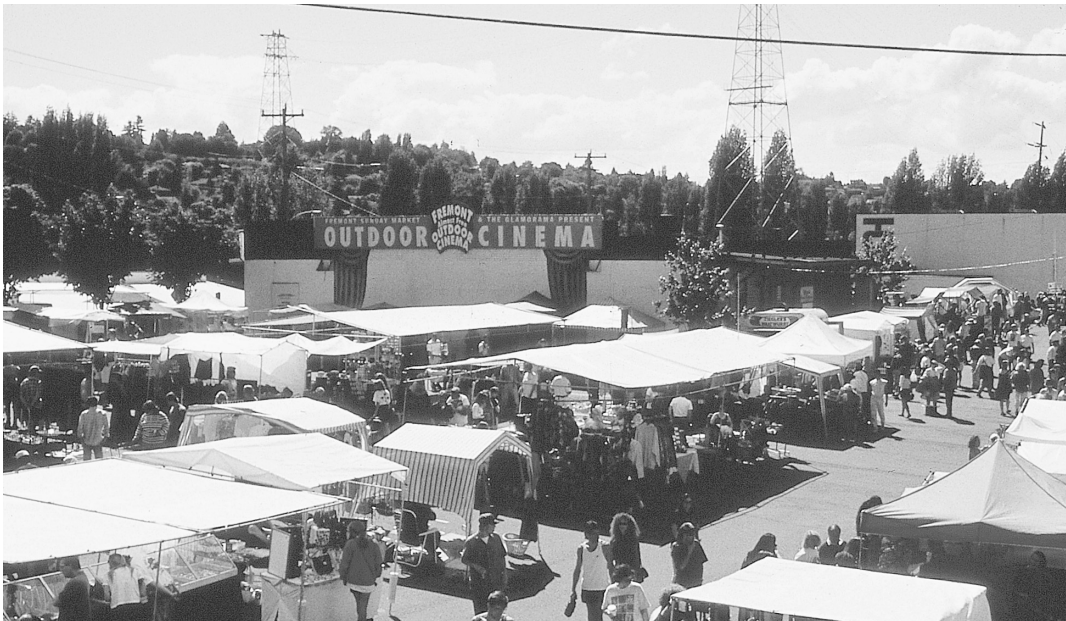
A parking lot in the Fremont neighborhood also serves as a town commons, providing space for an outdoor cinema (top) and open-air market (bottom).