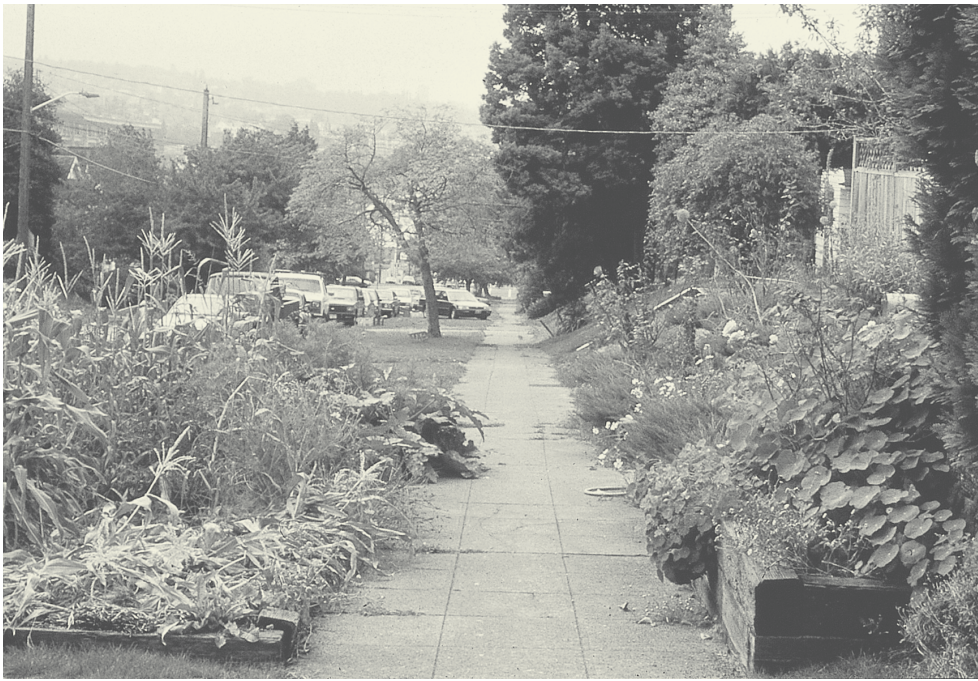
Median garden, Wallingford neighborhood

When asked, “What do you most enjoy about your median space?” eighty percent responded that others can see and enjoy the garden, and sixty percent said it increased interaction with neighbors and passersby.