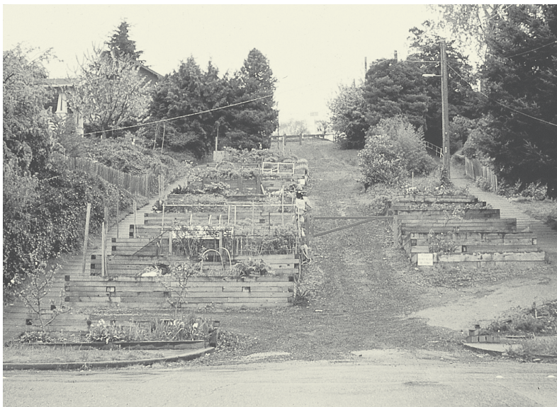
Street right-of-way converted to community gardens, Phinney Ridge neighborhood

Students met with representatives of three main interest groups: heavy industry and trucking, design businesses and residents. The residents' major concerns were negative pedestrian