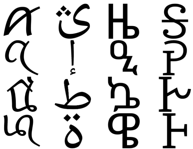
Figure 1: Glyph rendering samples (column-wise left-to-right: Tai-Viet, Arabic, Ethiopic, and Cherokee).

In total, 4,747 glyphs were produced with a Python script as PNG images from standard Unicode ranges (Figure 1). Glyphs were uniformly rendered in black and placed on transparent background, using Noto typefaces for each writing system.