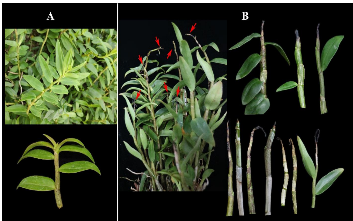
Figure 1. Natural symptoms on Dendrobium officinale tissue associated with Fusarium spp. (A) Healthy plant; (B) typical dieback on the stem.

In September 2021, symptoms of the dieback disease on D. officinale emerged in Yueqing, Zhejiang Province, China. According to the field observations, high temperature, high humidity, and poor ventilation would accelerate the incidence rate of this condition, which was at about 40–60% based on the number of plants with dieback disease symptoms recorded in 30 rows randomly picked. The symptoms appeared as chlorotic, blighted, and wilted leaves of the apical meristem with the shoot tip showing dark brown necrosis, dieback, and eventually shoot death (Figure 1). A total of 152 Fusarium -like isolates were also recovered from 70 infected plants, and 20 representative isolates were selected for further analysis (Table 2). Each isolate was recovered from different infected stems. Consistent with their morphological traits as well as molecular methods, the isolated fungi belonged to five genera, encompassing F. concentricum , F. curvatum , F. fujikuroi , F. nirenbergiae , and F. stilboides . Comparing the isolation frequency accordingly revealed that F. concentricum was the most abundant species, followed by F. curvatum , F. fujikuroi , and F. nirenbergiae , while F. stilboides was found the least (Table 2). Interestingly, two, and occasionally more than two, different Fusarium spp. were simultaneously isolated from some samples, and finally confirmed by the tef1 and rpb2 sequence analyses.