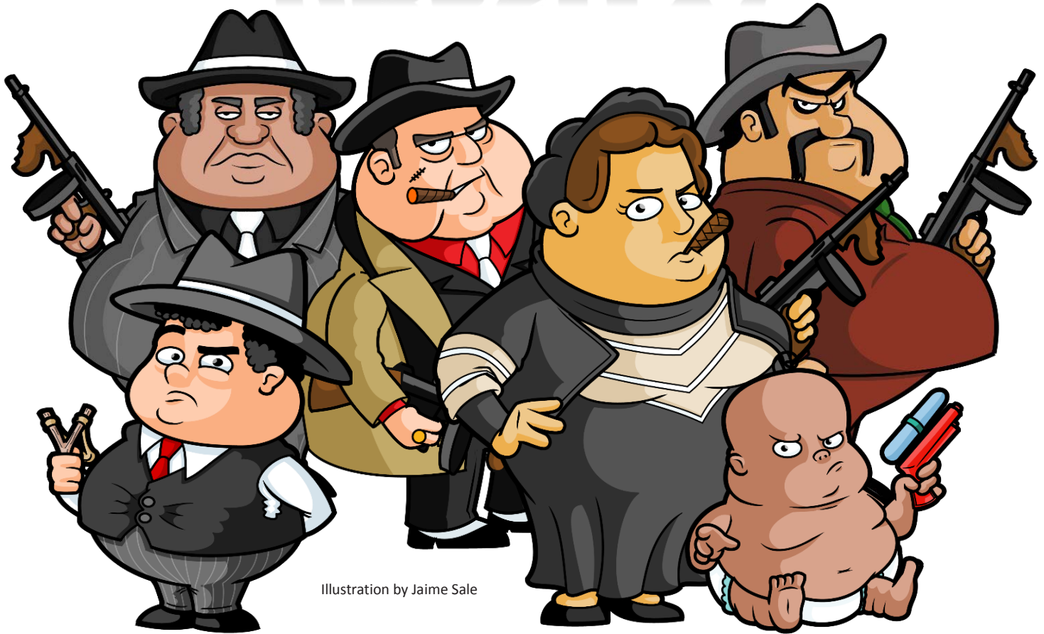
Illustration by Jaime Sale