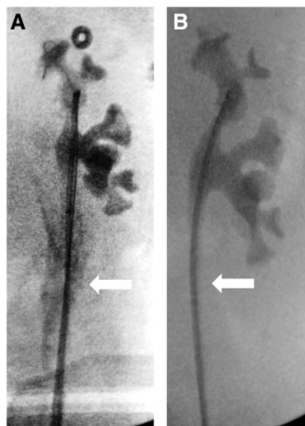
FIG. 2. Representative selection of intraoperative fluoroscopic images showing contrast extravasation at initial ureteroscopy (A) and resolution of ureteral injury after stent placement 6 weeks postoperation (B).