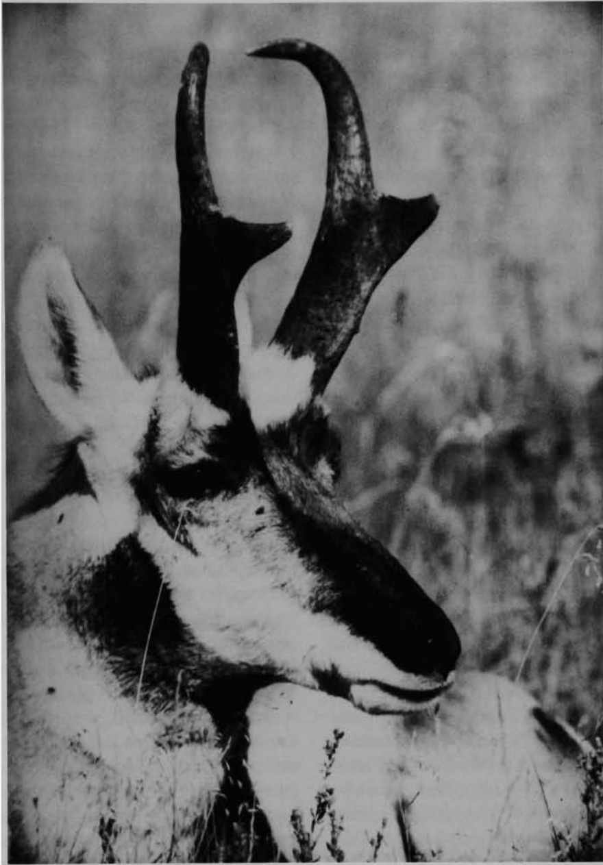
Fig. 1. Photograph of a pronghorn buck.