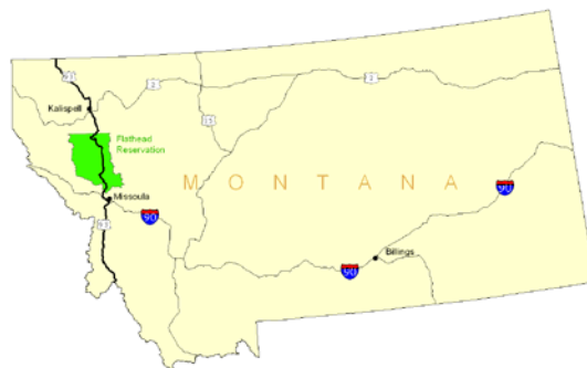
Fig.1. Location of the Flathead Indian Reservation and U.S. Highway 93.

Much of the FIR is rural and agricultural in nature but Reservation lands face accelerated development pressures due to the proximity of rapidly growing urban centers at Missoula and Kalispell, highway expansion, and the natural beauty and recreational opportunities in the area. Resident population is projected to increase by 50 percent during the period 1994 to 2025 with development expected to occur at a faster pace in the rural areas rather than the urban areas (CSKT 1996). The Tribes are concerned that an expanded highway will harm the rural character of the Flathead Reservation and adversely impact traditional cultural values.