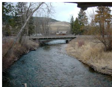
Fig. 4. The Jocko River is a “core area” for bull trout ( Salvelinus confluentus ) recovery in Montana (Montana Bull Trout Scientific Group 1996) and is the focus of a Tribal wetland, riparian habitat and bull trout restoration program (CSKT 2000a). The existing crossing is a two-lane, approximately 30 m (100 ft) bridge lacking vertical clearance for large wildlife species passage. Buildings, septic systems, roads, bridge abutment fill, parking lots, and a horse corral occupy the floodplain. The lane configuration will be expanded from a two-lane to a three-lane. The new crossing will be a three-lane 120m (393ft) multi-span bridge with 4-5m (14-16ft) of vertical clearance. Bridge approaches will be constructed with vertical retaining walls to minimize fill in the floodplain. Buildings and the horse corral will be removed. The floodplain will be graded to original elevations and contours and planted with native wetland and riparian vegetation. Stormwater runoff from the bridge and roadway will be treated in vegetated bioswales and treatment wetlands.