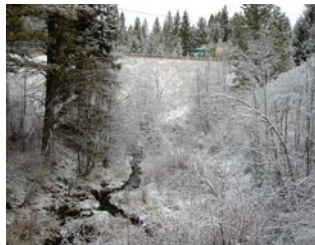
Fig. 6. View from abandoned roadway at Finley Creek tributary to present highway alignment where a large wildlife underpass will be constructed. The tributary passes through the abandoned roadway in an undersized culvert. Fill material will be removed to original contours and elevations and used for new road construction. The stream channel and riparian area will be fully restored. Removal of the roadbed will eliminate a barrier to wildlife movement to and from the underpass.