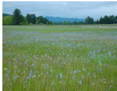
Fig. 3. This wetland is a Category I (FHWA and MDT 1996) wetland of special concern (CSKT 1999). The new lane configuration adds a northbound passing lane. The wetland will be avoided by shifting additional highway width away from the wetland and by reducing the standard ratio 6:1 side slopes to between 4:1 and 2:1 with guardrail. The wetland is Tribal Trust land and the Tribal Council has redesignated the wetland from agricultural use to wetlands mitigation. The wetland mitigation status of the site will protect and maintain habitat connectivity between wildlife crossing structures that will be constructed north and south of the wetland.