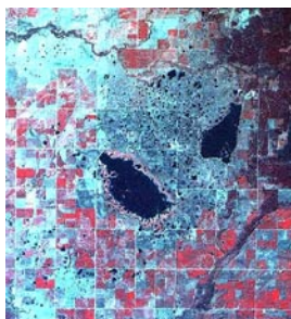
Fig. 10. A high altitude infrared photograph of the Ninepipe area. The Ninepipe pothole wetlands complex supports the highest density of pothole wetlands in western Montana.

The Ninepipe segment includes a rural section spanning the Ninepipe pothole wetlands complex and an urban section through the community of Ronan. The ecological, cultural and social issues involved in reconstructing the highway through the Ninepipe segment will be evaluated by the Tribes, MDT, and FHWA during the preparation of a Supplemental Environmental Impact Statement (SEIS). The three governments will consult with affected State and Federal agencies and have invited extensive public participation. The three governments have selected nine alternative lane configurations for the rural section. One of the more controversial lane configurations includes 6,870m (22,540ft) of raised parkway. Estimated unavoidable wetland impacts for the nine rural alternatives range from 7.2 to 10.1 hectares (17.91 to 24.90 acres).