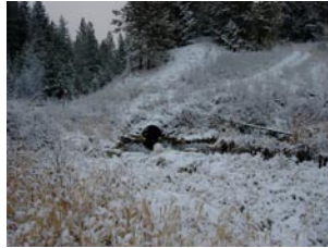
Fig. 5. The historic alignment of “old Highway 93” abandoned in 1964, continues to occupy the floodplain of Finley Creek. The creek passes through the abandoned abutment in an undersized culvert. Fill material extends onto the floodplain. Fill material will be removed to original contours and elevations and used for new road construction. The stream channel and riparian area will be restored.