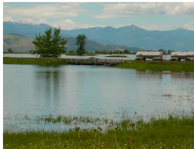
Fig. 11. Highway 93 through the Ninepipe Wildlife Refuge. The existing bridge will be replaced with a longer bridge improving connectivity for water and wildlife.

Over 1, 214 hectares (3,000 acres) of Tribal lands within the Ninepipe wetlands complex are managed specifically for wildlife and wildlife habitat to mitigate for impacts to wildlife and wildlife habitat resulting from the Kerr Hydro Power project on Flathead Lake. The Tribes habitat acquisition and restoration plan for Kerr mitigation identifies the Ninepipe wetlands complex as a priority area for Kerr wetland and riparian habitat mitigation (CSKT 2000b). Avoidance criteria similar to Section 4(f) will be applied to Tribal wetland and wildlife mitigation lands.