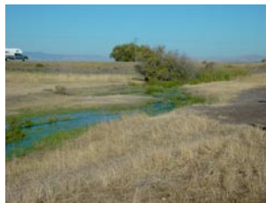
Fig. 8. A large wildlife underpass will be constructed at this Post Creek Tributary. The stream channel and riparian area will be restored.