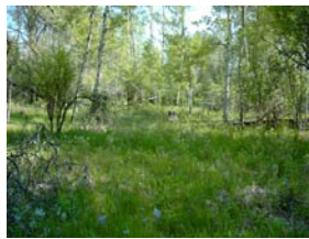
Fig. 7. This wetland of special concern will be preserved to protect culturally significant plants.