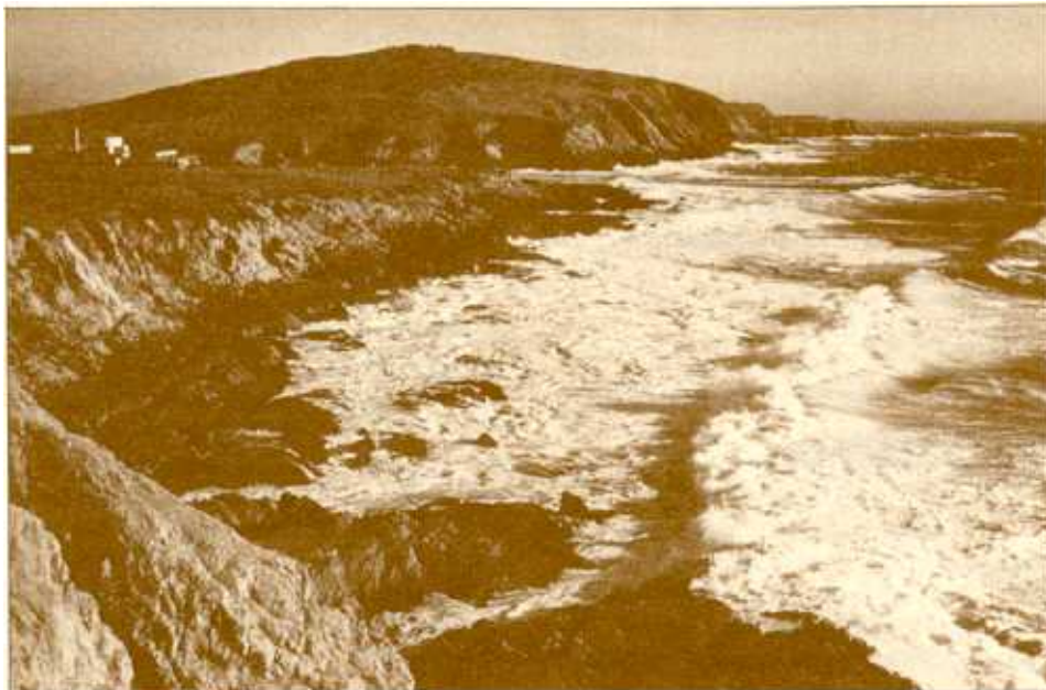
The Bodega Marine Reserve provides faculty and students with a diverse array of subtidal, intertidal, and terrestrial habitats in close proximity to the sophisticated facilities and equipment of the Bodega Marine Laboratory.