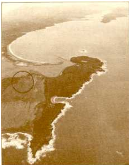
Aerial view of Bodega Head looking south along the San Andreas fault zone to Tomales Bay. The Marine Lab is adjacent to Horseshoe Cove and the housing facility is adjacent to Bodega Harbor (circled).