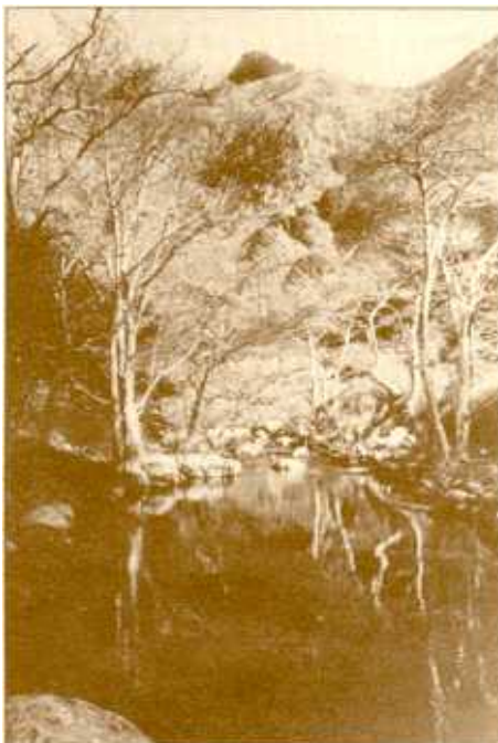
Big Creek, third largest stream on the Big Sur Coast, drains the heart of the new Biosphere Reserve on the Big Sur Coast.

Portions of the Los Padres National Forest's Ventana Wilderness encompassing the Big Creek watershed were also incorporated into the Biosphere Reserve. The Big Creek Reserve is located on the rugged Big Sur Coast 45 miles south of Monterey.