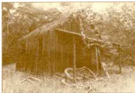
This 100-year old cabin at the Baronda homestead site is one of several post-aboriginal historical sites documented by the Big Creek archaeological survey team.

Archaeologists hypothesize that these shifts in site locations over the past 4000