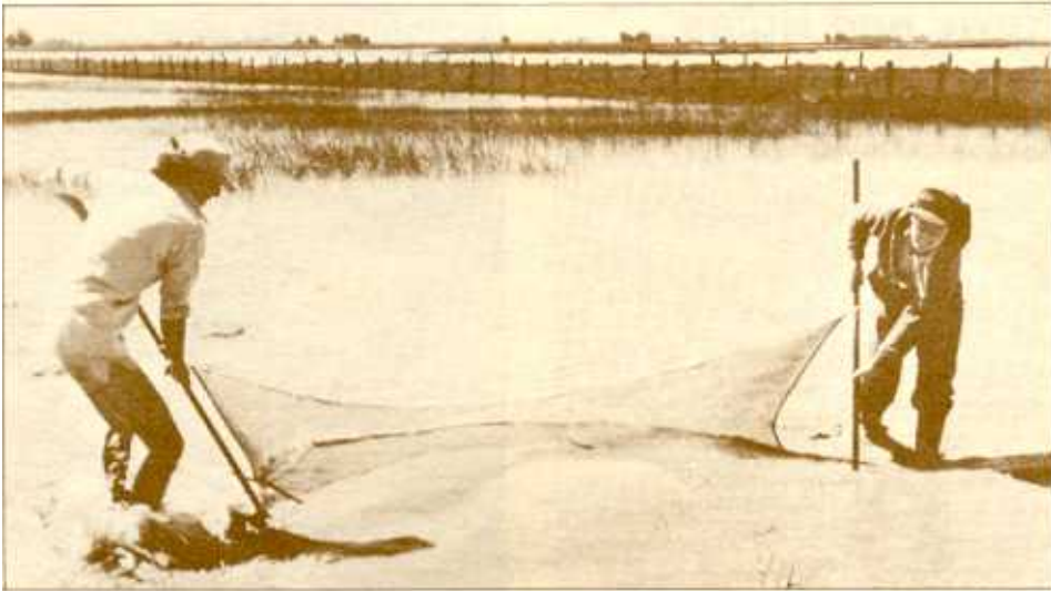
UC Davis researchers collect aquatic insects from the Jepson Prairie Reserve's Olcott Lake. Its summer-dry lake bed provides the only known habitat for Solano grass ( Tuctoria mucronata ), a state- and federally-listed endangered species.