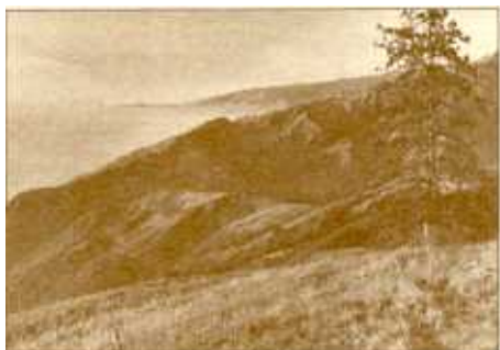
Rugged topography and dense vegetation of the Landels-Hill Big Creek Reserve made a thorough archaeological survey a challenge.

This variation in shell midden location clearly represents a wide range of time and energy that aboriginal inhabitants were willing to invest to obtain these marine resources. One possible explanation for this variation is that middens further from the shore may have been sited to more effectively exploit terrestrial plants and animals over those of the marine environment. (Undoubtedly, such factors as water supply, level ground, and a desire to avoid low coastal fog may also have played a role). Since it is unlikely that all of the sites were occupied concurrently, they may document a time sequence of changing adaptive strategies with shifts in the dependence on marine versus terrestrial resources. Such shifts are of great theoretical interest to archaeologists trying to understand relationships between aboriginal peoples and the resources of their environment.