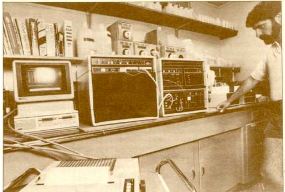
Dr. Steven Nodvin supervises the chemical analysis of snow and lake water samples using a computer-controlled ion chromatograph. The sophisticated instrumentation is based at the Sierra Nevada Aquatic Research Laboratory.

As the new masthead proclaims, our program name has been officially shortened from the Natural Land and Water Reserves System to the Natural Reserve System. The new streamlined name is easier to say and avoids past confusion with programs responsible for water conservation in the state. We like our new name. We think you will too.