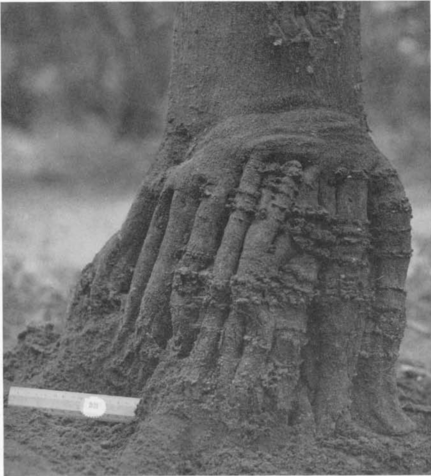
Fig. 4. Laminate shelling, a type of bark eruption seen occasionally on trifoliate orange rootstocks. While resembling scaling due to exocortis, it is not associated with any stunting of the tree; therefore, this symptom is assumed not to indicate the presence of exocortis virus.

The three above-mentioned cases of false exocortis are all distinguishable from true