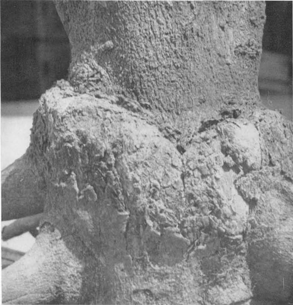
Fig. 5. "Podagra," a disease of kumquat trees on Rough lemon rootstocks, the symptoms of which suggest that affected trees are on trifoliate orange stocks and that the butts are scaling because of exocortis.

Although exocortis does not at present loom large in Florida's citrus economy, it does represent an indirect source of loss, because it prevents use of a potentially valuable, much-needed rootstock. With Florida's sour orange acreage (about 15 per cent of the total) in jeopardy because of tristeza, there is great demand for stocks that will tolerate tristeza virus and yet grow satisfactorily in the heavy, wet soils of the State's coastal areas. Because of its resistance to foot rot and tolerance to tristeza and cold, and because of its production of fruit with high solids, trifoliate orange is a logical replacement for sour orange. It is hoped that the Florida Budwood Certification Program with its objective of finding varieties free of exocortis virus, or that the use of nucellar budwood, will some day turn this valuable rootstock to the State's account.