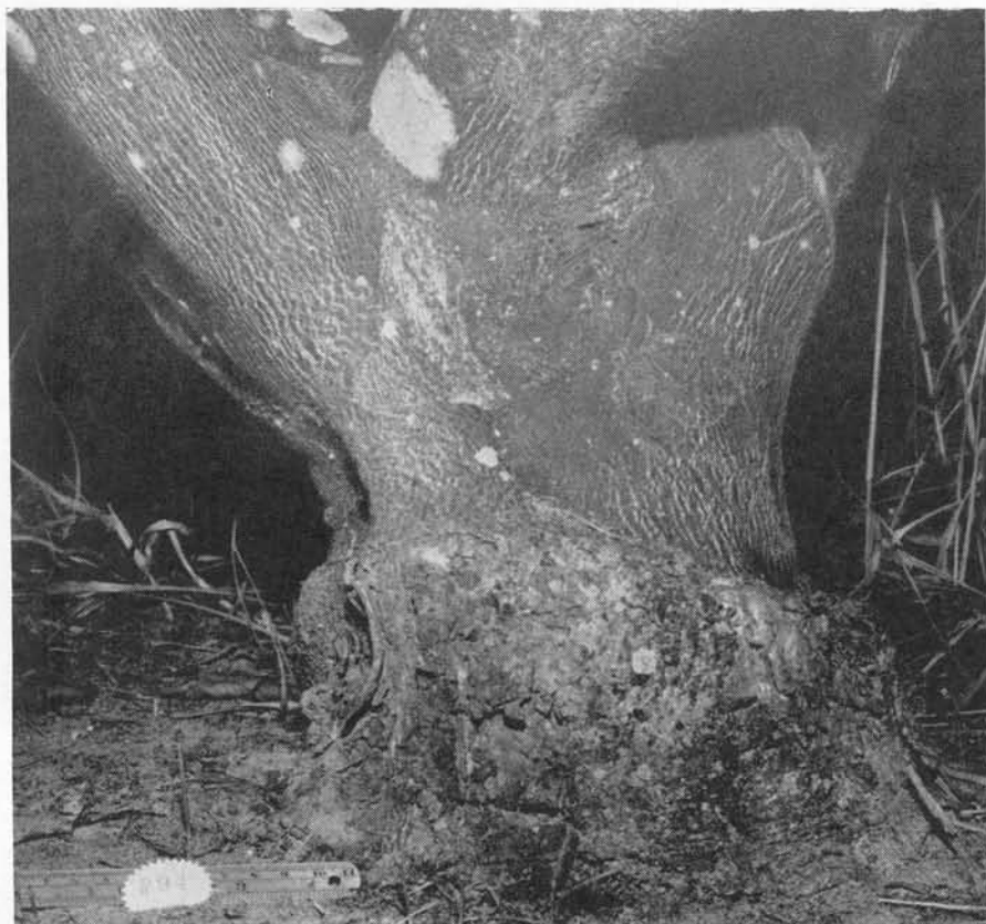
Fig. 3. Butts resembling those formed by trifoliate orange may be produced by certain other varieties of citrus. Pictured here is a sweet orange tree on Florida Everbearing lemon rootstock. Swelling of the butt and the accompanying scaling may lead to confusion in the diagnosis of exocortis, as well as to the improper identification of the rootstock.

Another set of symptoms confusable with exocortis is a beaded type of eruption occasionally seen here on trifoliate butts (fig. 4). The eruptions consist of patches of laminated bark varying in width from \frac{1}{4} to 1 or 2 inches. These areas occur as arcs \frac{1}{2} to 5 inches long curving around the trifoliate-orange portion of the trunk. The