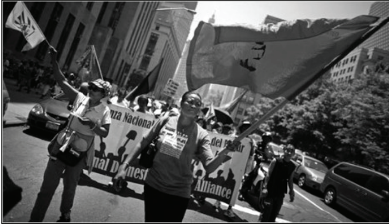
Figure 1: On June 7, 2008, National Domestic Workers Congress Lead March for the New York State Domestic Workers' Bill of Rights ( New York Times ).

initially led primarily by Filipina domestic workers but incubated into DWU, a multiracial organization that has succeeded in changing local and state labor laws and coordinating domestic worker rights organizing across the country. Immigrant women generally have played crucial leadership roles in DWU, which has reported that 99 percent of domestic workers in New York City were foreign-born and 76 percent were not U.S. citizens (Domestic Workers United and Data Center, 2006, 10). Through their efforts, domestic workers in general and, more specifically, the Filipina workers in New York and Los Angeles analyzed here have countered popular assumptions that they are satisfied with their conditions or too isolated to change them.