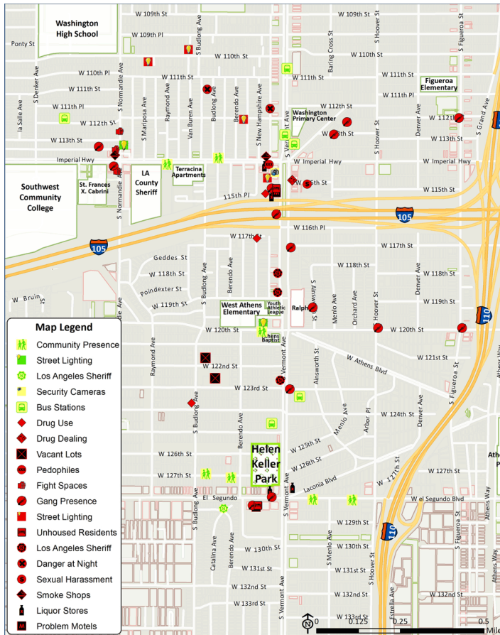
Figure 2. Digitized participatory geographic information systems map of community park access assets and challenges, South Los Angeles, 2015.

Residents were also concerned about criminal activity around tobacco shops and, to a lesser extent, MMDs (although no MMDs were identified on the maps provided), with a young participant describing these properties as spaces that attract crime and violence. Although the literature at the time of our mapping project had noted property and violent crime associations with MMDs (33), crime-related research on tobacco shops was markedly absent; 1 study had documented associations between tobacco shop density and social deprivation (34), a known correlate of crime (35).